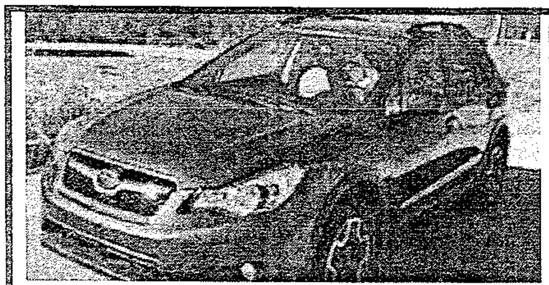
2013 Subaru Crosstrek Leather, AWD, Wheels, Cooled Seats, Heated Seats, Tow, Rear Backup Camera