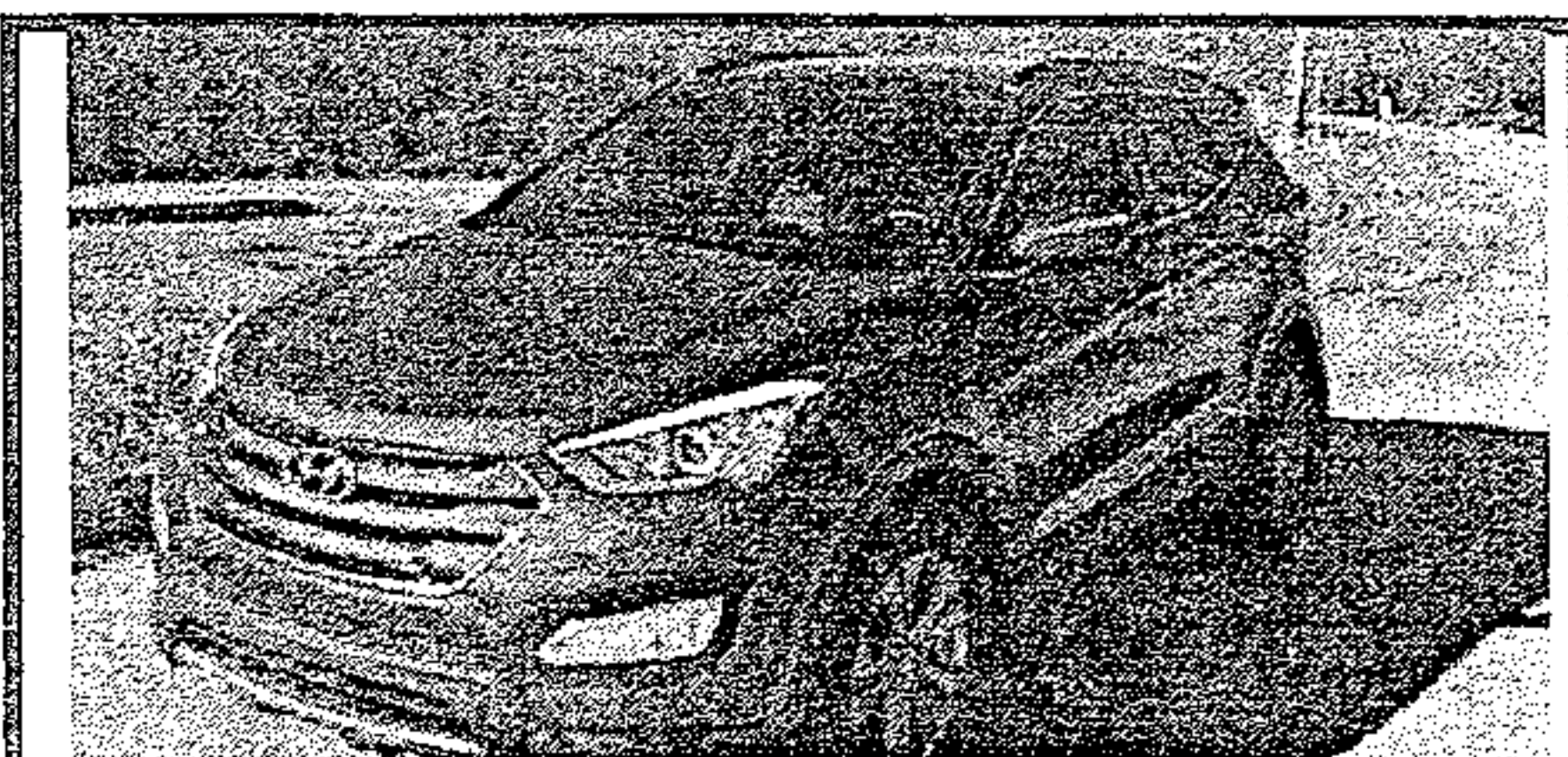
2014 Hyundai Santa Fe Dual Sunroof, Alloy Wheels, Leather, Heated & Cooled Seats, PS