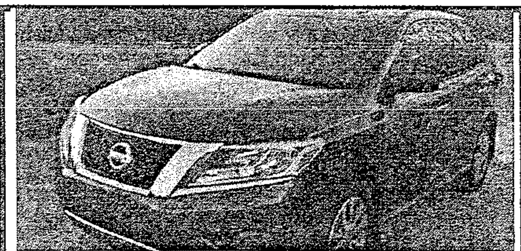
2014 Nissan Pathfinder Loaded, 3rd Row Seat, Alloy Wheels, Like New, Great On Gas, PW, PL