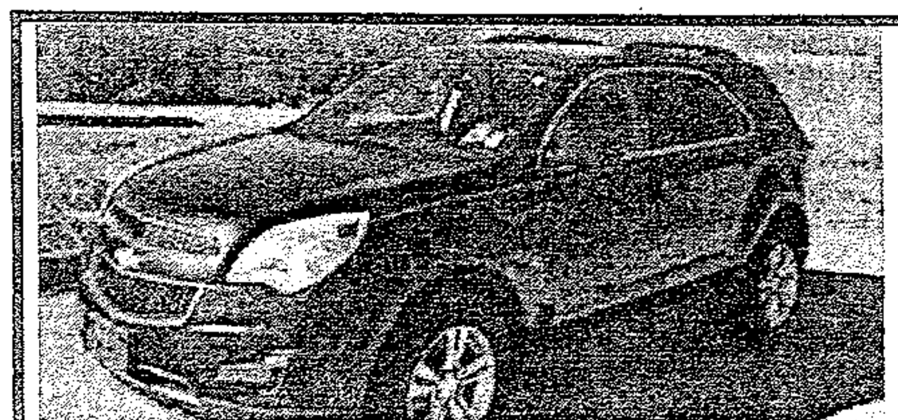
2012 Chevy Equinox Auto, PS, PW, PL, Alloy Wheels, 2 Tone Interior, Luggage Rack