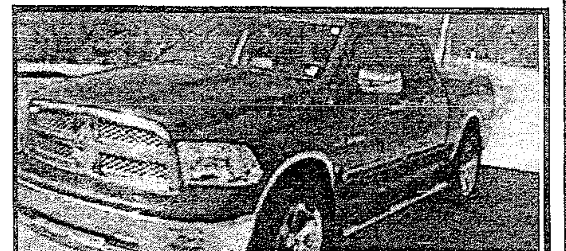
2009 Dodge Ram 4x4, Mega Cab, Leather, Laramie, Hemi, Chrome Wheels, Ram Box