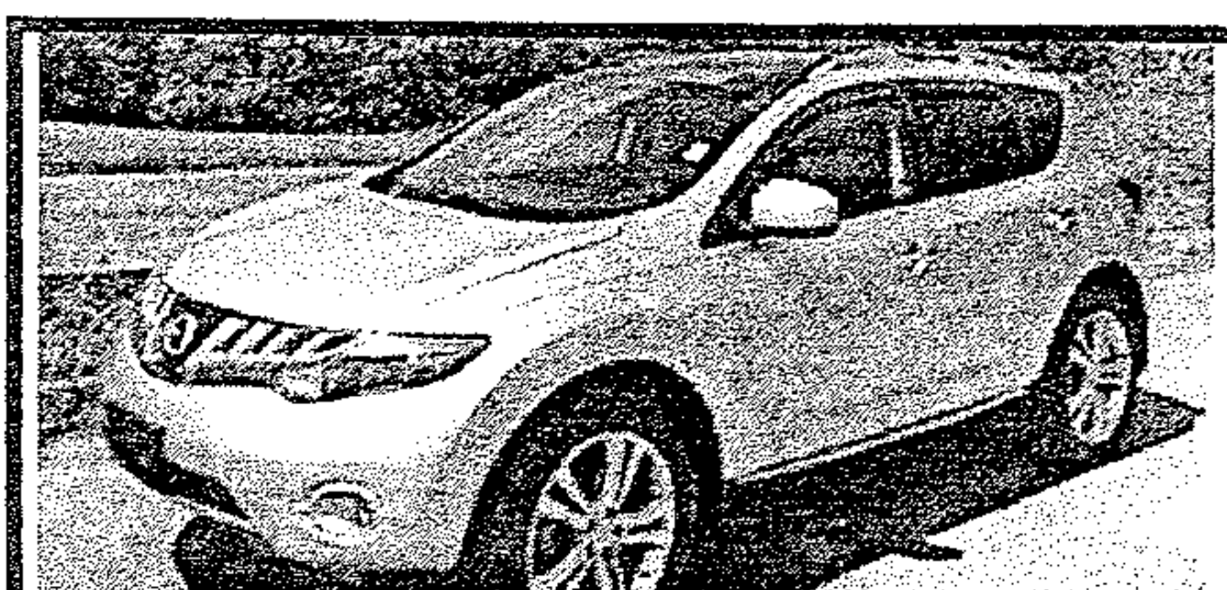
2009 Nissan Murano Loaded, Leather, PW, PL, Sunroof, Alloy Wheels, AWD, Spacious, PS