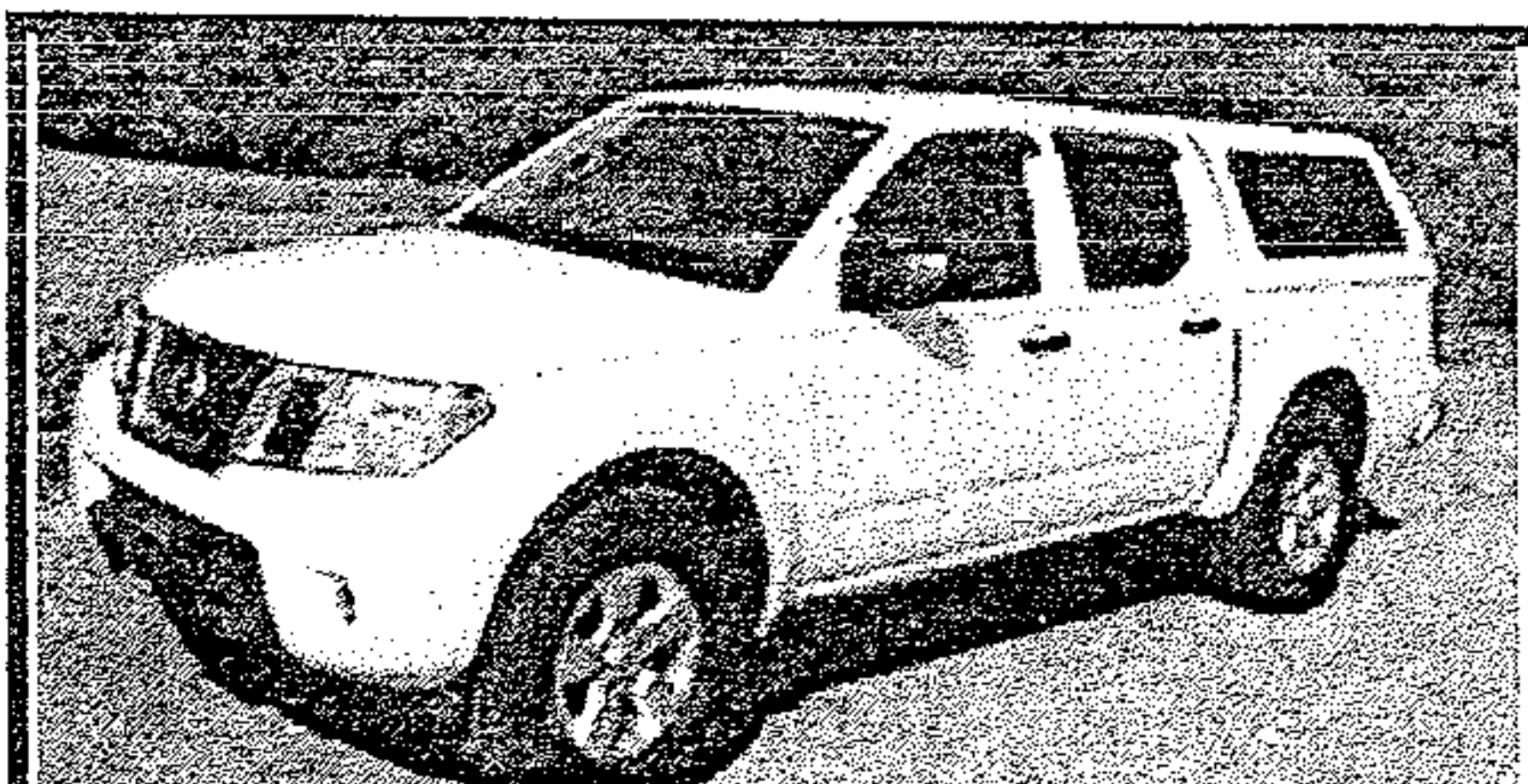
2013 Nissan Frontier Alloy Wheels, Auto Torneau Cover, Tow, PW, PL, Cold Air, Great Miles