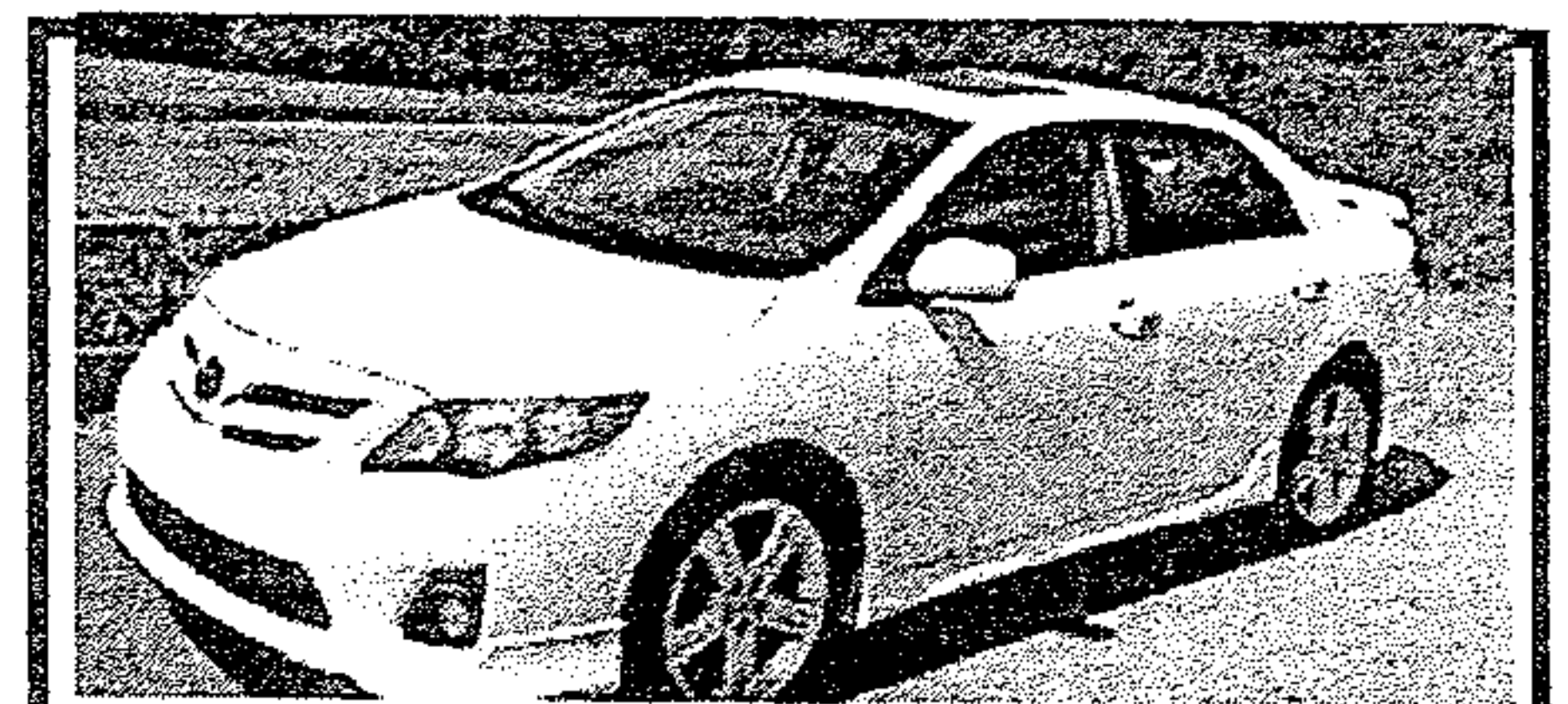
2013 Toyota Corolla Low Miles, Like New, Local Car, Alloy Wheels, PW, PL, 4 Cyl, A/C, Auto