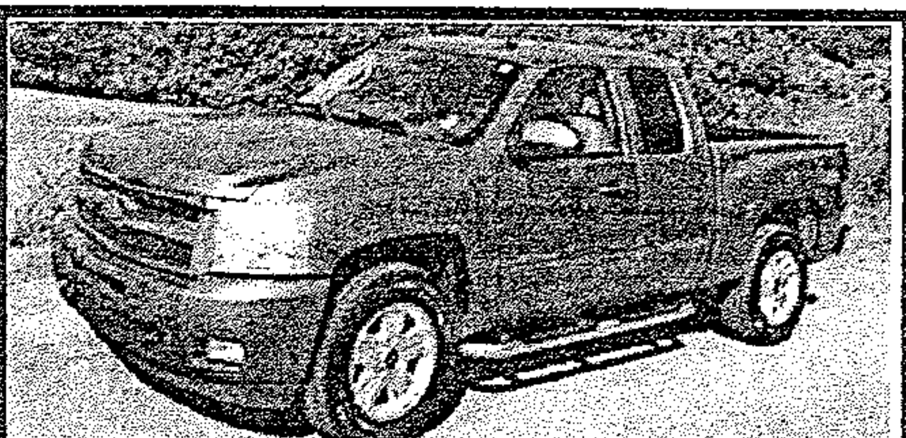
2009 Chevy Silverado LTZ, 4X4, Leather, Ext. Cab, Tow, Bed Liner, PW, PL, V8 Power