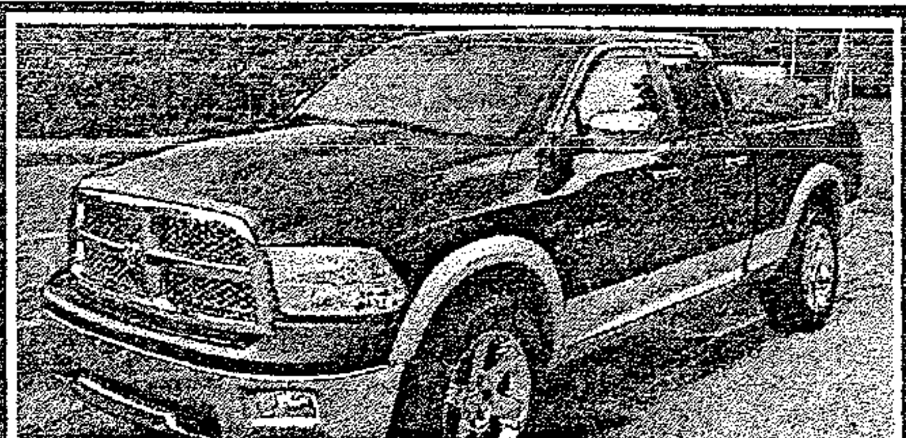
2010 Dodge Ram, Laramie, Loaded, 4X4, PW, PL, PS, V8, Leather, Tow Package, Alloy Wheels