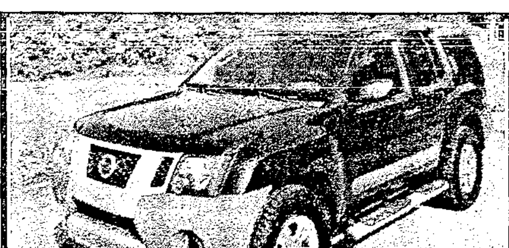
2011 Nissan Xterra Like New, A/C, PW, PL, Luggage Rack, Auto, Alloy Wheels