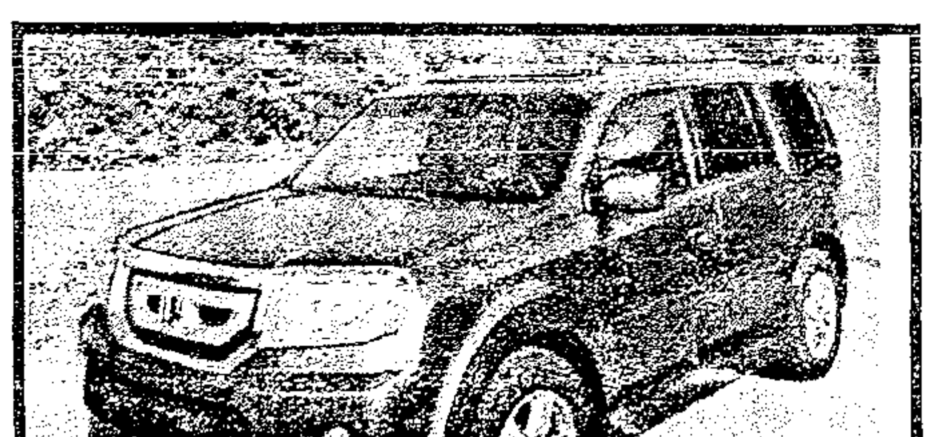
2011 Honda Pilot ;Leather, Sunroof. 4wd, Alloy Wheels, DVD. 3rd Row Seating, Tow Package