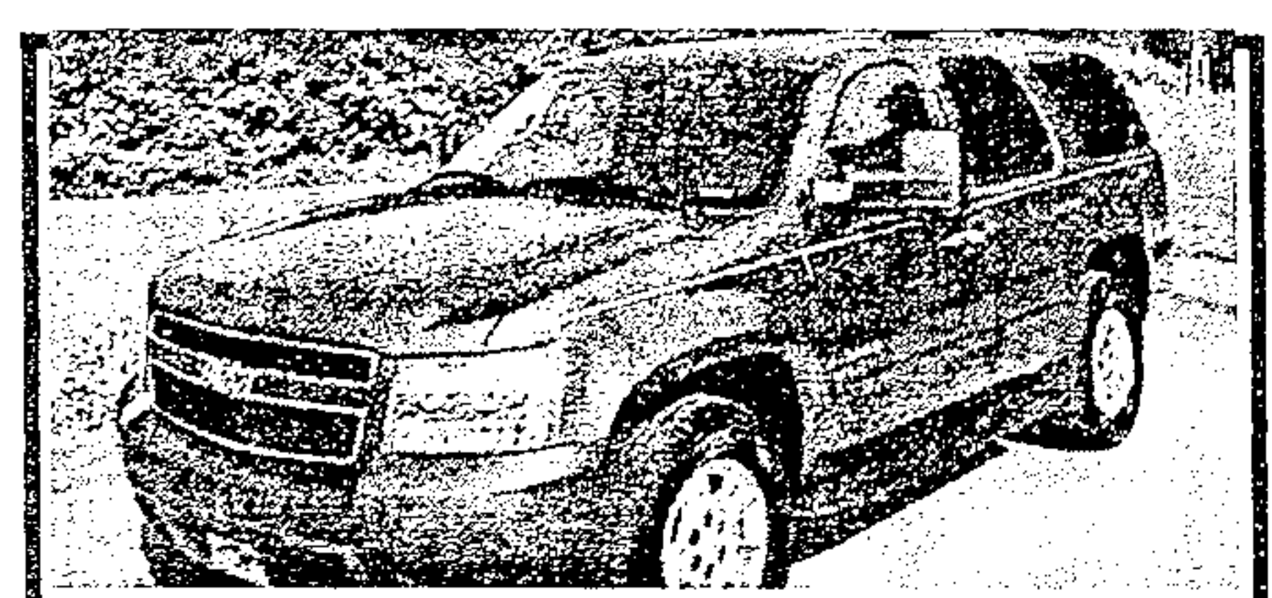
2009 Chevy Tahoe V8, Auto, PW, PL, Alloy Wheels, Tow Package, PS, Great Shape