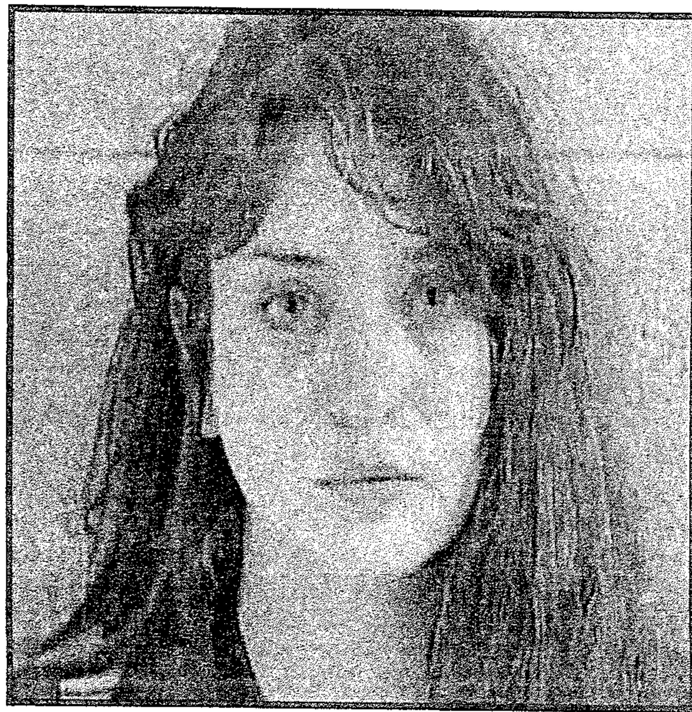
see DUI pg. 3