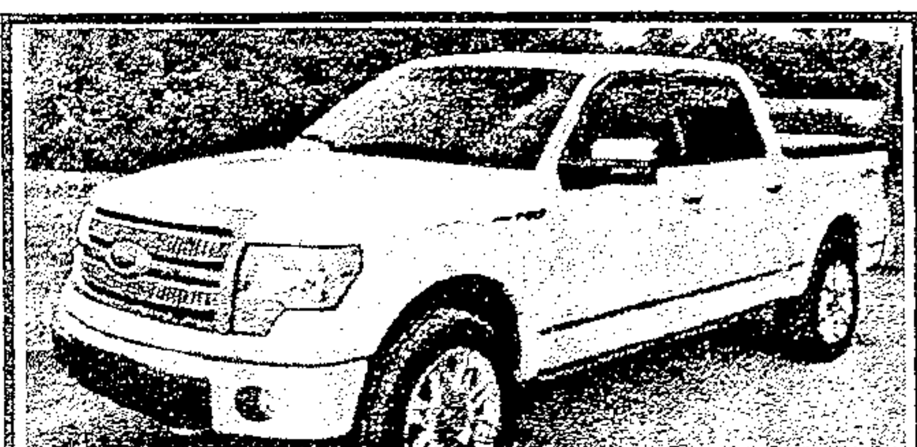
2010 Ford F150 Platinum PKG, Power Run. Boards, NAV, Ent. PKG, Leather, Heated/Cooled Seats