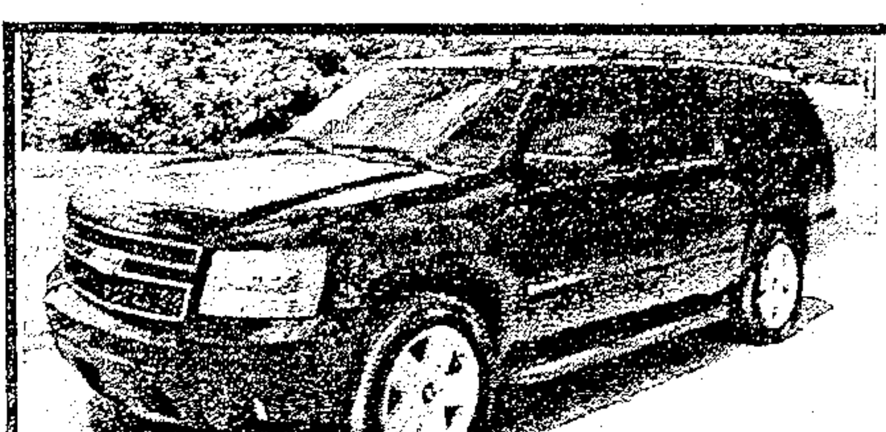
2007 Chevy Suburban LTZ Alloy Wheels, Leather, 3rd Row, Sunroof, Luggage Rack, PW, PL, DVD, NAV