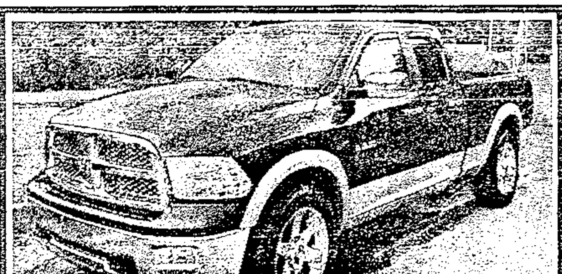
2010 Dodge Ram, Laramie, Loaded, 4X4, PW, PL, PS, V8, Leather, Tow Package, Alloy Wheels