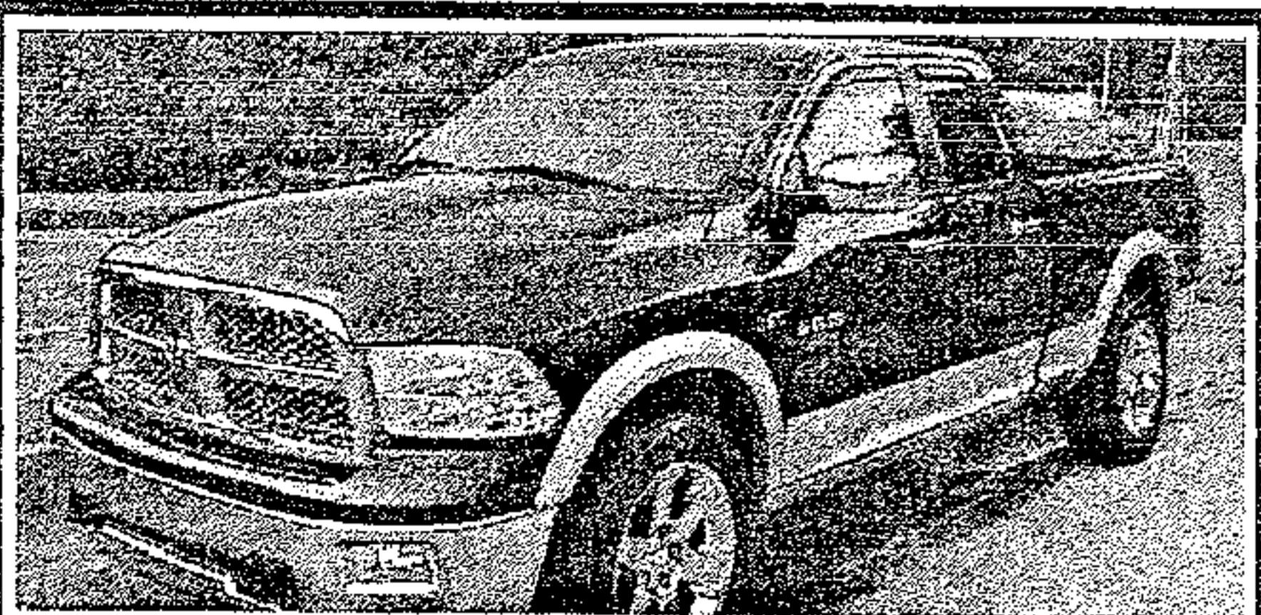
2010 Dodge Ram, Laramie, Loaded, 4X4, PW, PL, PS, V8, Leather, Tow Package, Alloy Wheels