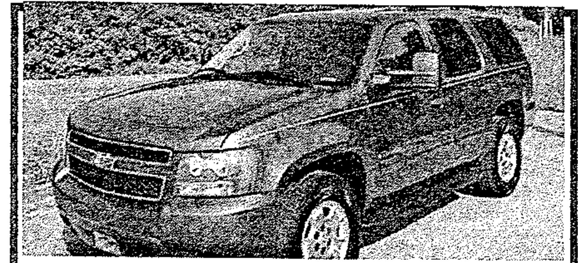
2009 Chevy Tahoe V8, Auto, PW, PL, Alloy Wheels, Tow Package, PS, Great Shape

DEPENDABLE MOTORS 986-9343 803 E. Broadway • Lenoir City