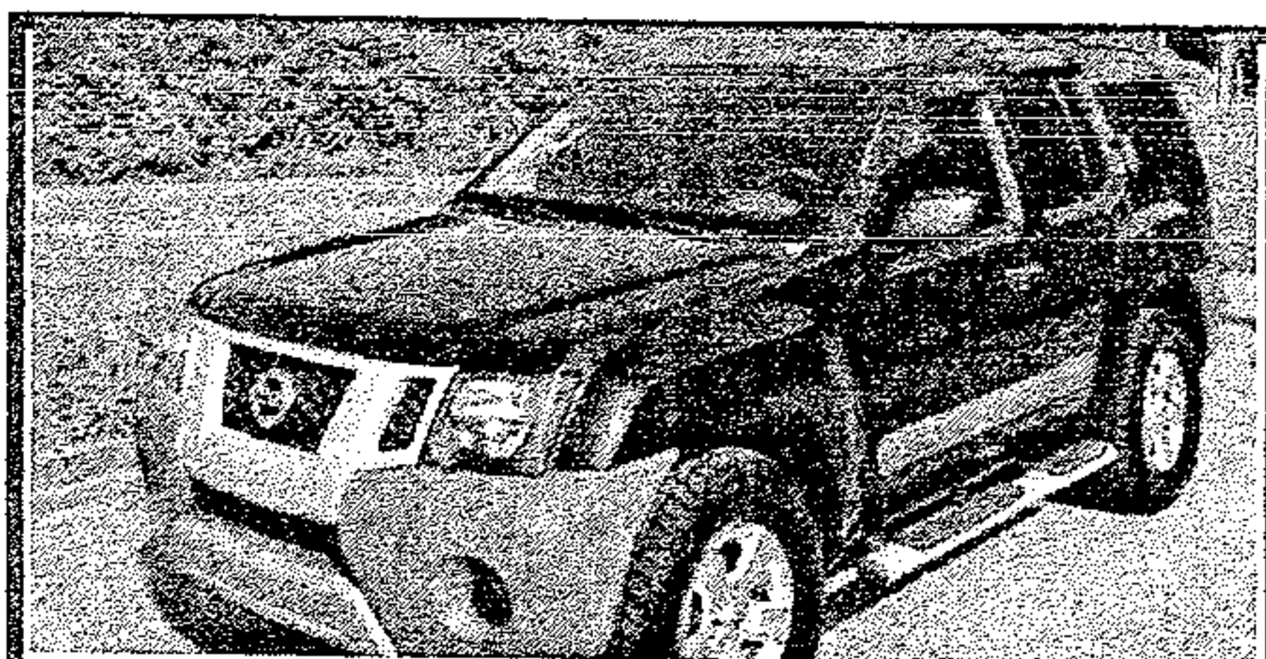
2011 Nissan Xterra Like New, A/C, PW, PL, Luggage Rack, Auto, Alloy Wheels