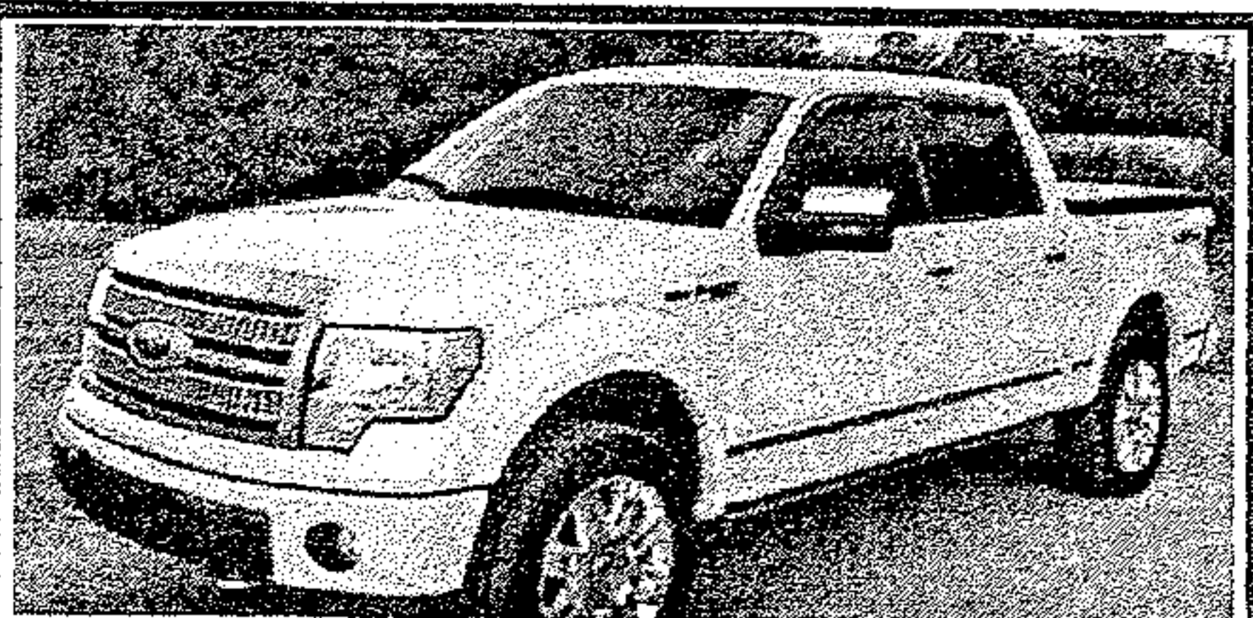
2010 Ford F150 Platinum PKG, Power Run. Boards, NAV, Ent. PKG, Leather, Heated/Cooled Seats