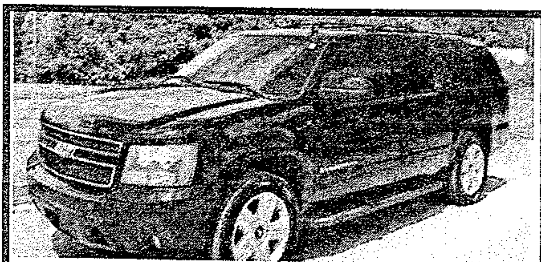
2007 Chevy Suburban LTZ Alloy Wheels, Leather, 3rd Row, Sunroof, Luggage Rack, PW, PL, DVD, NAV