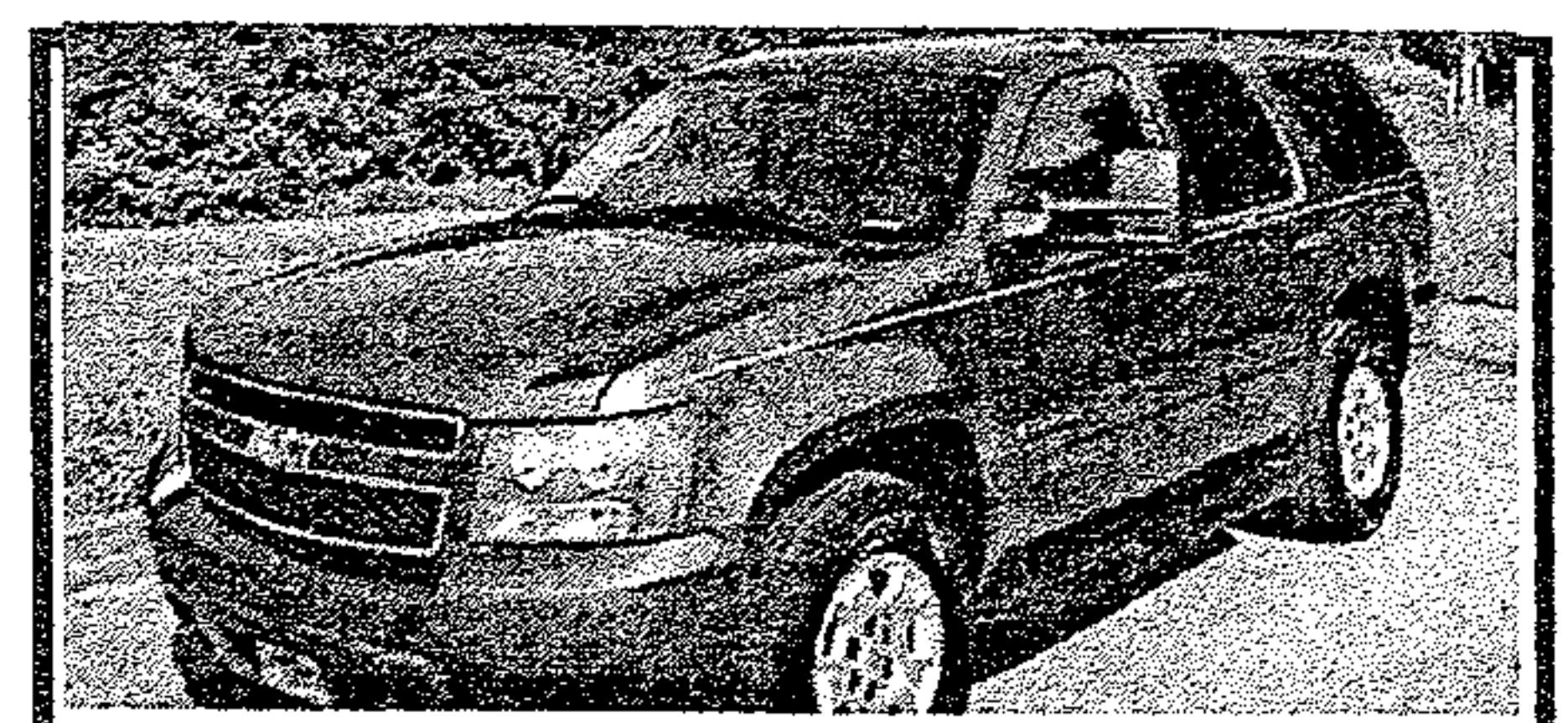
2009 Chevy Tahoe V8, Auto, PW, PL, Alloy Wheels, Tow Package, PS, Great Shape