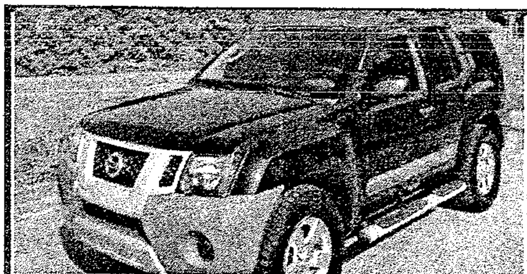
2011 Nissan Xterra Like New, A/C, PW, PL, Luggage Rack, Auto, Alloy Wheels