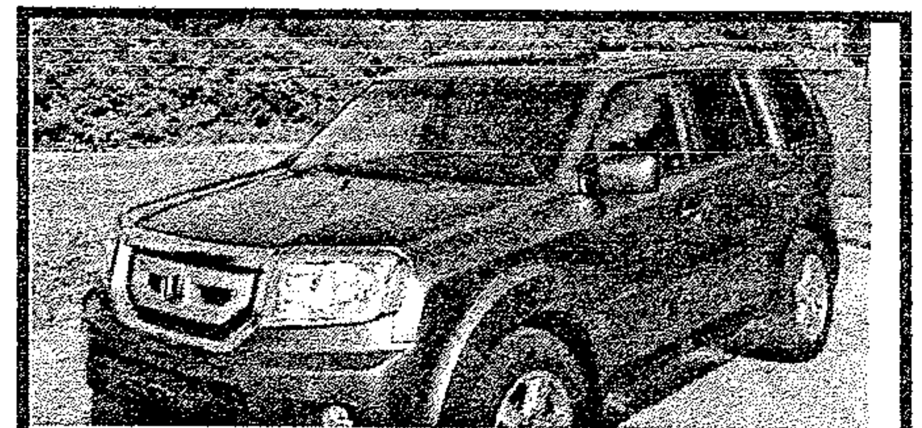
2011 Honda Pilot ;Leather, Sunroof. 4wd, Alloy Wheels, DVD. 3rd Row Seating, Tow Package