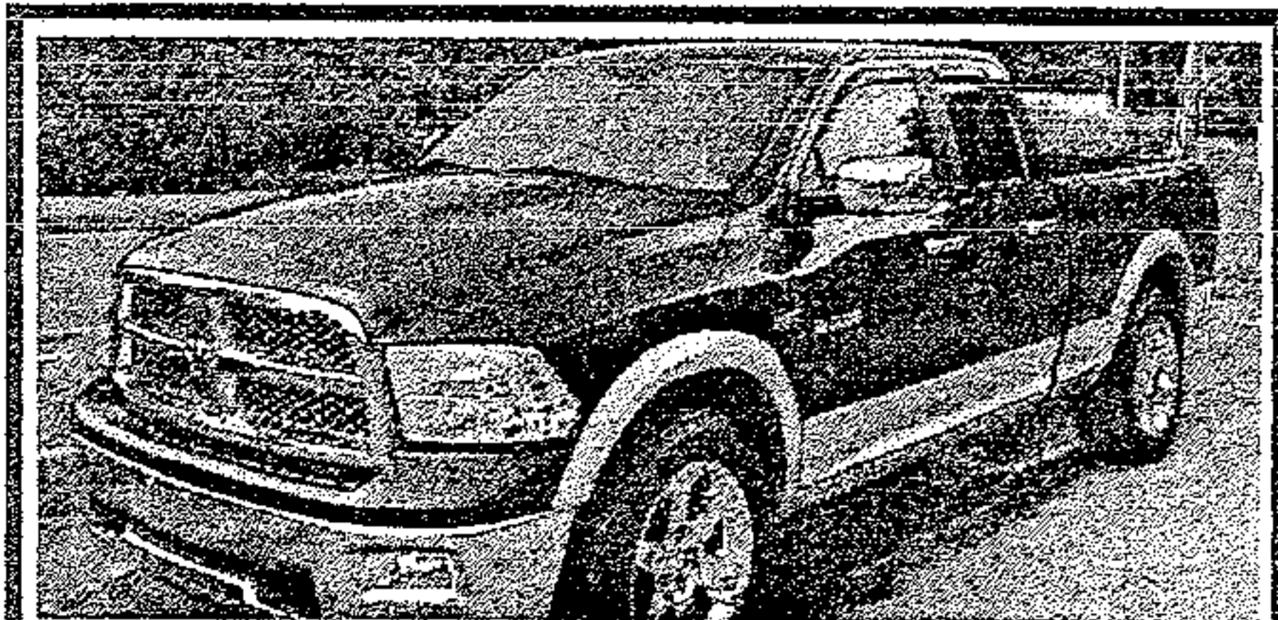
2010 Dodge Ram, Laramie, Loaded, 4X4, PW, PL, PS, V8, Leather, Tow Package, Alloy Wheels