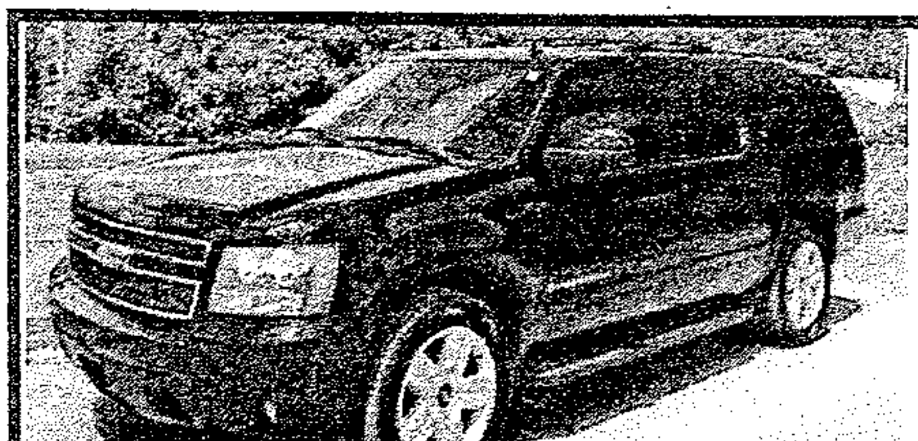
2007 Chevy Suburban LTZ Alloy Wheels, Leather, 3rd Row, Sunroof, Luggage Rack, PW, PL, DVD, NAV