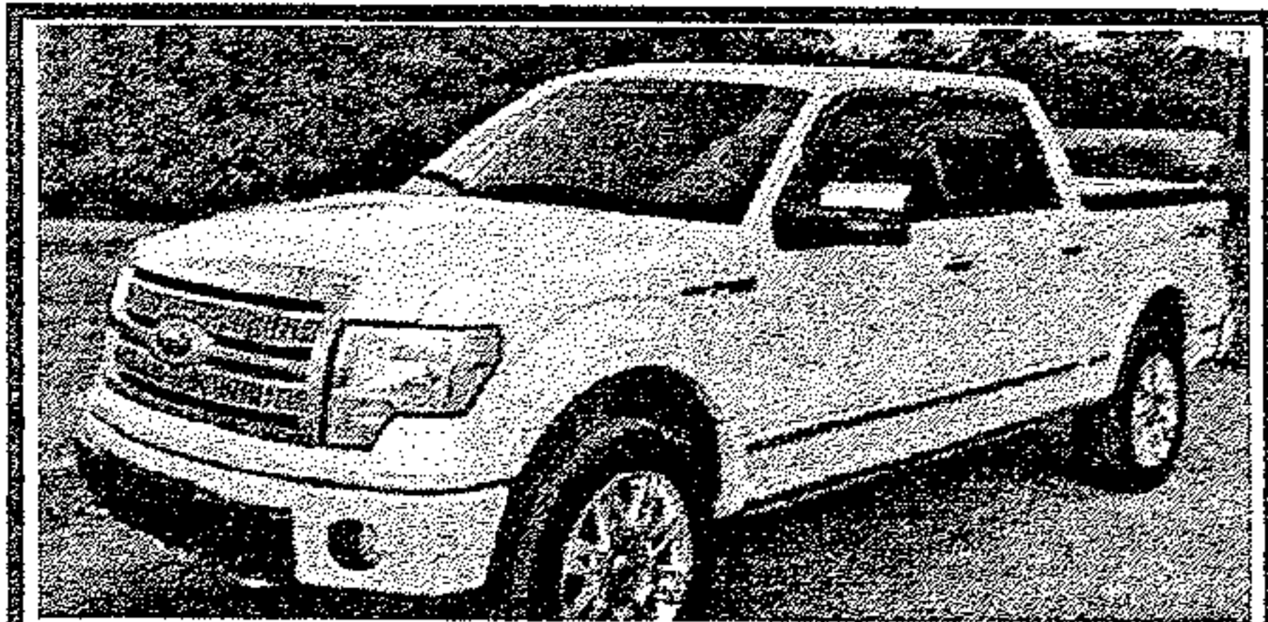
2010 Ford F150 Platinum PKG, Power Run. Boards, NAV, Ent. PKG, Leather, Heated/Cooled Seats