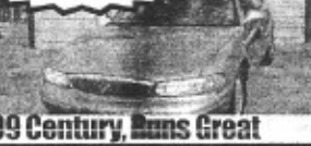
99 Century, Runs Great