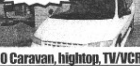
00 Caravan, hightop, TV/VCR