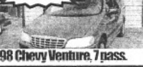
98 Chevy Venture, 7pass.