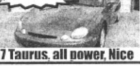
97 Taurus, all power, Nice