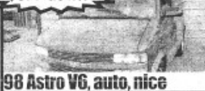
98 Astro V6, auto, nice