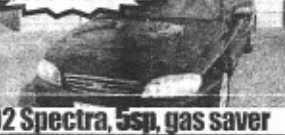
02 Spectra, 5sp, gas saver