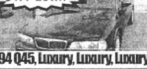
94 Q45, Luxury, Luxury, Luxury