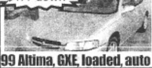
99 Altima, GXE, loaded, auto