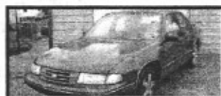
92 Lumina, V6, auto