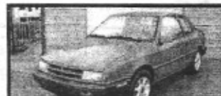
92 Shadow, 5sp, Gas Saver