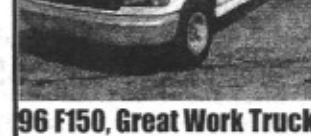
96 F150, Great Work Truck, Cold AC, Auto, Lock Boxes