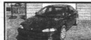
97 Intrepid, Cold AC, V6, auto