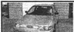
93 Ford Escort, 5sp, gas saver