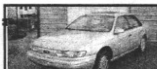
93 Taurus, sunroof, loaded