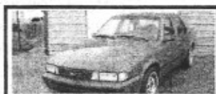
89 Cavalier, 4 cyl, Gas Saver

Pay your taxes within 4 weeks of purchase***