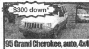
95 Grand Cherokee, auto, 4x4