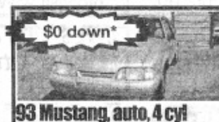
93 Mustang, auto, 4 cyl