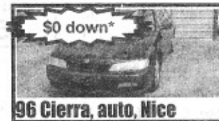
96 Cierra, auto, Nice