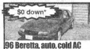
96 Beretta, auto, cold AC