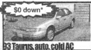
93 Taurus, auto, cold AC