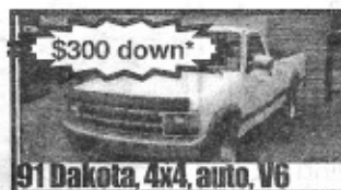
91 Dakota, 4x4, auto, V6