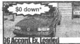
96 Accord, Ex. Loader