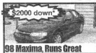
98 Maxima, Runs Great