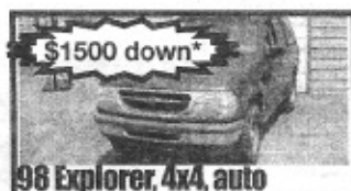
98 Explorer, 4x4, auto