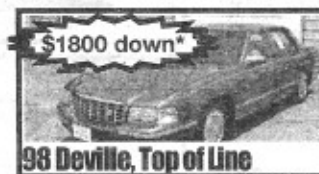
98 Deville, Top of Line