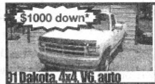
01 Dakota, 4x4 V6, auto