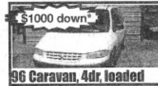
96 Caravan, 4dr, loaded