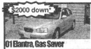
01 Elantra, Gas Saver