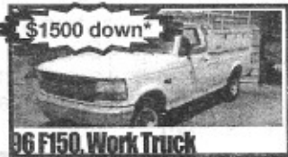
96 F150, Work Truck