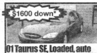
01 Taurus SE, Loaded, auto