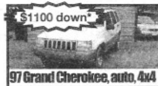
97 Grand Cherokee, auto, 4x4