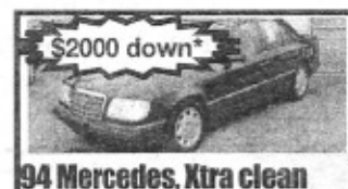
94 Mercedes, Xtra clean