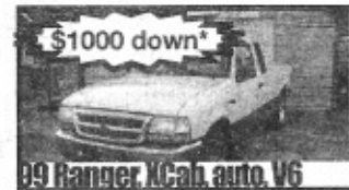
99 Ranger, XCal, auto, V6