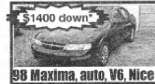
98 Maxima, auto, V6, Nice