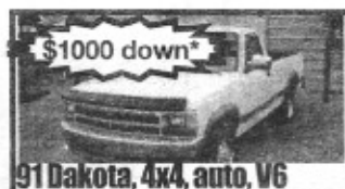
91 Dakota, 4x4, auto, V6