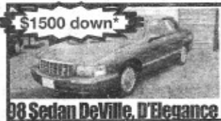
98 Sedan DeVille, D'Elegance