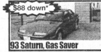
93 Saturn, Gas Saver