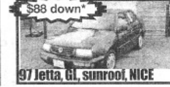
97 Jetta, GL, sunroof, NICE