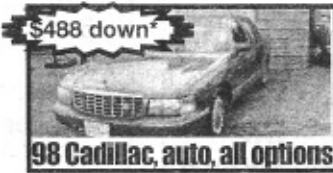
98 Cadillac, auto, all options