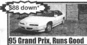
95 Grand Prix, Runs Good