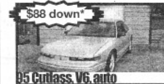
95 Cutlass, V6, auto