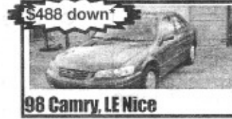
98 Camry, LE Nice