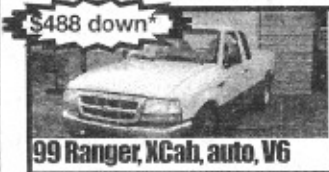
99 Ranger, XCab, auto, V6