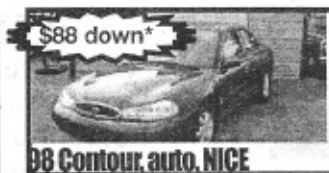
98 Contour, auto, NICE