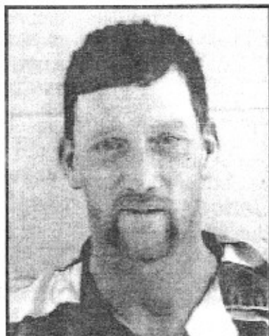
Wade Edward Wilson