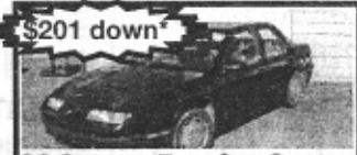
$201 down* 93 Saturn, 5sp, Gas Saver