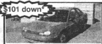
$101 down* 99 Neon, auto, 4 cyl