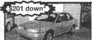
$201 down* 93 Escort, 5sp, Gas Saver