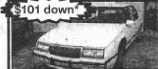
$101 down* 91 Buick Lesabre, runs great