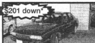
$201 down* 92 Buick Regal, runs great

Dependable Cars in the Same Location for over 9 years