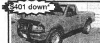
$401 down* 93 Ranger, V6, 4x4