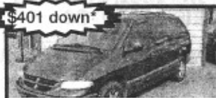
$401 down* 97 Dodge Caravan, V6 loaded