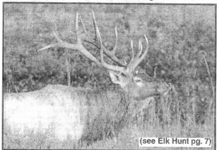
(see Elk Hunt pg. 7)