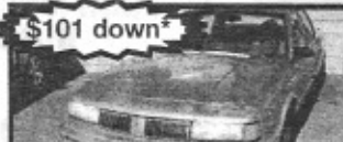
96 Cierra, Runs Great