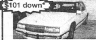
91 LeSabre, Runs Great