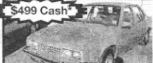
86 Cavalier, auto, gas saver