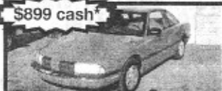
92 Achieva, V6, Power