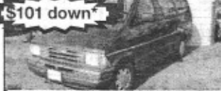
94 Aerostar, 7 passenger