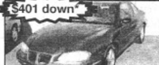
96 Grand Am, Sporty V6