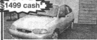
97 Aspire, Super Gas Miles