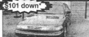
97 Crown Vic, V8 Power