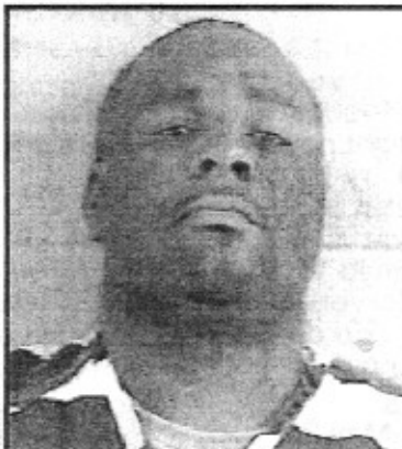
William Douglas Hawkins, Jr.