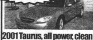
2001 Taurus, all power, clean