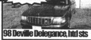
98 Deville Delegation, Intl sts