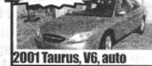
2001 Taurus, V6, auto