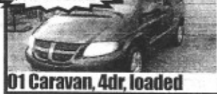
01 Caravan, 4dr, loaded