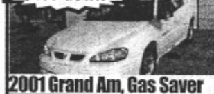
2001 Grand Am, Gas Saver