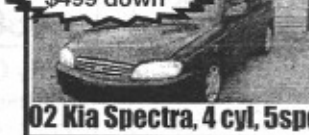
02 Kia Spectra, 4 cyl, 5spd