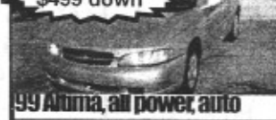
99 Altima, all power, auto