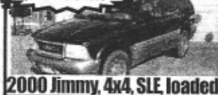
2000 Jimmy, 4x4, SLE, loaded