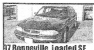
97 Bonneville, Loaded SE