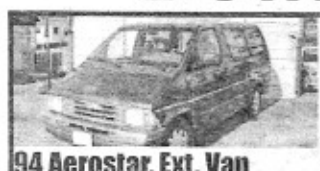
94 Aerostar, Ext. Van