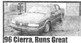
96 Ciera, Runs Great