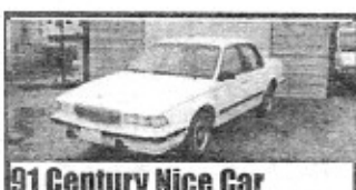
91 Century Nice Car