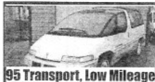
95 Transport, Low Mileage