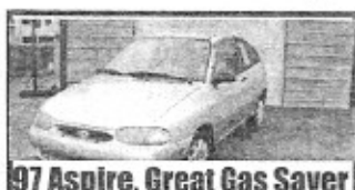
97 Aspire, Great Gas Saver