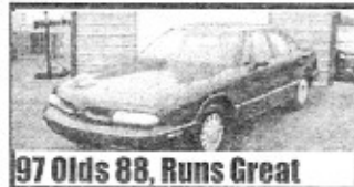
97 Olds 88, Runs Great