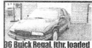
96 Buick Regal, lthr. loaded