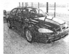
2004 Pontiac Grand AM Midnight Black, Gray cloth interior. Sunroof, AM/FM CD/MP3 Monsoon Stereo, Chrome factory rims. Powerful V6 Automatic Stk# 521451