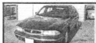
97 Bonneville, Loaded SE