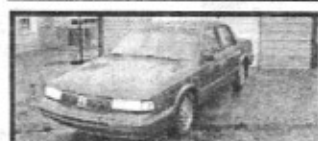
96 Ciera, Runs Great