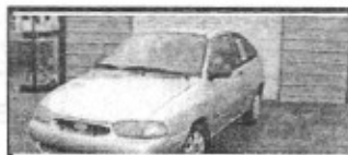
97 Aspire, Great Gas Saver