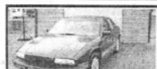
96 Buick Regal, lthr. loaded