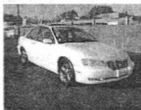
1999 Cadillac Catera Pearl White Rich tan leather interior, AM/FM CD Bose Stereo, All Power, $6995 $1680 down @ 21.9% Payments: $78.31 weekly for 2 years!!! Stk # 521021