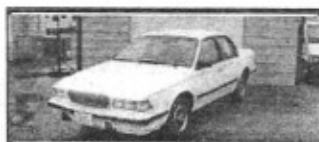
91 Century Nice Car