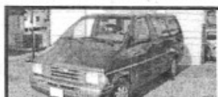
94 Aerostar, Ext. Van