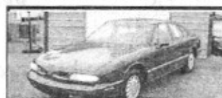
97 Olds 88, Runs Great