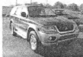
2000 Mitsubishi Montero Sport Black Tan leather interior. Sunroof, AM/FM CD Stereo, Running boards, Fog lamps, Power windows/locks. New Tires! Very Sporty! Stk# 521061

We are the perfect solution to help you build or rebuild your credit or just get a vehicle financed. We have vehicles to suit your specific needs in all price ranges. All payments will be scheduled to fit your budget. Pay weekly, bi-weekly, semi-monthly, or monthly. At Clayton Autos, you make your payment at our location, so we get to know all of our customers like family. Come be part of our family today. Call (865) 689-3268 for details!