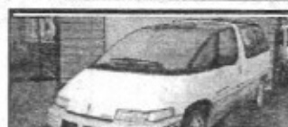
95 Transport, Low Mileage