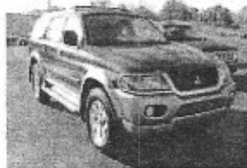
2000 Mitsubishi Montero Sport Black Tan leather interior, Sunroof, AM/FM CD Stereo, Running boards, Fog lamps, Power windows/locks, New Tires! Very Sporty! Stk # 521061

We are the perfect solution to help you build or rebuild your credit or just get a vehicle financed. We have vehicles to suit your specific needs in all price ranges. All payments will be scheduled to fit your budget. Pay weekly, bi-weekly, semi-monthly, or monthly. At Clayton Autos, you make your payment at our location, so we get to know all of our customers like family. Come be part of our family today. Call (865) 689-3268 for details!