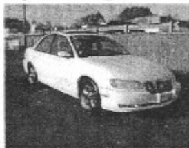
1999 Cadillac Catera Pearl White Rich tan leather interior, AM/FM CD Bose Stereo, All Power, $6995 $1680 down @ 21.9% Payments: $78.31 weekly for 2 years!!! Stk # 521021