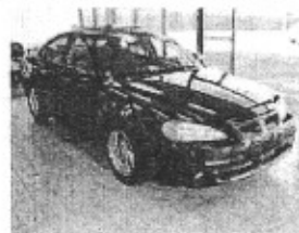
2004 Pontiac Grand AM Midnight Black, Gray cloth interior, Sunroof, AM/FM CD/MP3 Monsoon Stereo, Chrome factory rims, Powerful V6 Automatic Stk# 521451

www.buyhererepayhereknoxville.com Clayton Autos www.claytonbuyhererepayhere.com