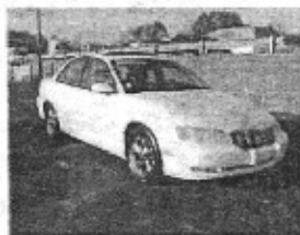
1999 Cadillac Catera Pearl White Rich tan leather interior, AM/FM CD Bose Stereo, All Power, $6995 $1680 down a 21.9% Payments: $78.31 weekly for 2 years!!! Stk # 521021