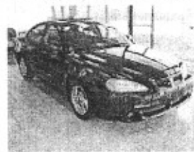
2004 Pontiac Grand AM Midnight Black, Gray cloth interior, Sunroof, AM/FM CD/MP3 Monsoon Stereo, Chrome factory rims, Powerful V6 Automatic Stk# 521451

www.buyhererepayhereknoxville.com Clayton www.claytonbuyhererepayhere.com