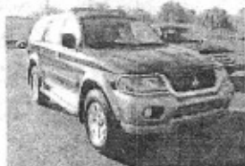
2000 Mitsubishi Montero Sport Black Tan leather interior, Sunroof, AM/FM CD Stereo, Running boards, Fog lamps, Power windows/locks, New Tires! Very Sporty! Stk# 521061

We are the perfect solution to help you build or rebuild your credit or just get a vehicle financed. We have vehicles to suit your specific needs in all price ranges. All payments will be scheduled to fit your budget. Pay weekly, bi-weekly, semi-monthly, or monthly. At Clayton Autos, you make your payment at our location, so we get to know all of our customers like family. Come be part of our family today. Call (865) 689-3268 for details!