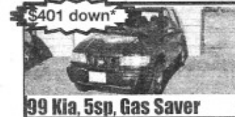
99 Kia, 5sp, Gas Saver