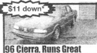
96 Cierra, Runs Great