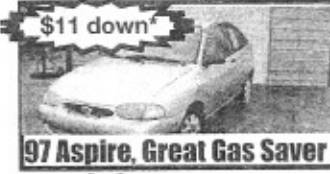
97 Aspire, Great Gas Saver