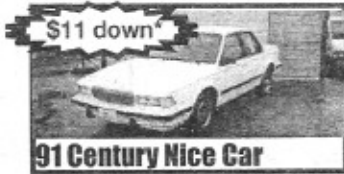
91 Century Nice Car