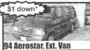
94 Aerostar, Ext. Van