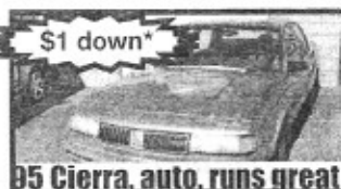
95 Cierra, auto, runs great