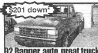
92 Ranger, auto, great truck