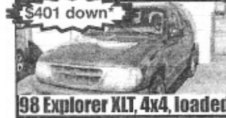
98 Explorer XLT, 4x4, loaded