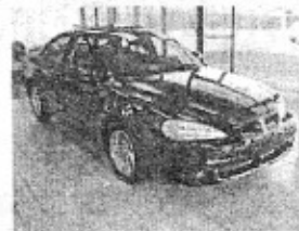
2004 Pontiac Grand AM Midnight Black, Gray cloth interior, Sunroof, AM/FM CD/MP3 Monsoon Stereo, Chrome factory rims, Powerful V6 Automatic Stk# 521451