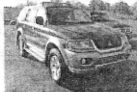
2000 Mitsubishi Montero Sport Black Tan leather interior, Sunroof, AM/FM CD Stereo, Running boards, Fog lamps, Power windows/locks, New Tires! Very Sporty! Stk# 521061

We are the perfect solution to help you build or rebuild your credit or just get a vehicle financed. We have vehicles to suit your specific needs in all price ranges. All payments will be scheduled to fit your budget. Pay weekly, bi-weekly, semi-monthly, or monthly. At Clayton Autos, you make your payment at our location, so we get to know all of our customers like family. Come be part of our family today. Call (865) 689-3268 for details!