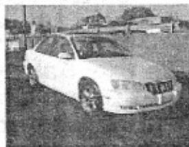
1999 Cadillac Catera Pearl White Rich tan leather interior, AM/FM CD Bose Stereo, All Power, $6995 $1680 down @ 21.9% Payments: $78.31 weekly for 2 years!! Stk # 521021