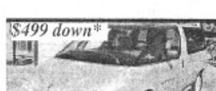
$499 down* Transport Van, 7 pass, Cold AC