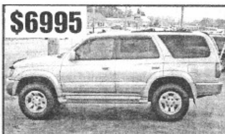
1997 Toyota 4Runner LIMITED 4X4, X-tra clean, Loaded