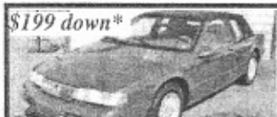
$199 down* Cougar, auto, All Pwr, Runs Great