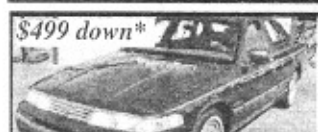
$499 down* Crown Vic, All Power Equip, Nice