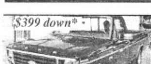
$399 down* F150, 4x2, auto, Runs Great, 6 cyl

Payments As Low As $59 a week* HURRY! These Deals Won't Last!!!