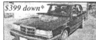
$399 down* Dynasty, Ex. Clean, Runs Great