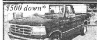
$500 down* F150, 4x4, auto, nice truck, cloth