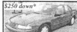
$250 down* Lumina, V6, auto, AC, Runs Great