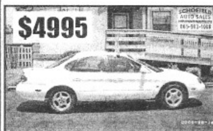
1999 Ford Taurus SE Top of the line Must see to appreciate