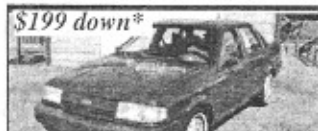
$199 down* Tempo, 4cyl, Great on Gas