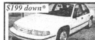
$199 down* Lumina, Runs Great, Factory Equip