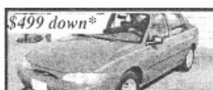
$499 down* Escort, auto, Great Gas Saver