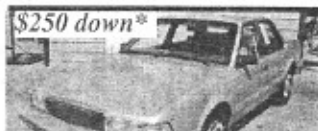
$250 down* Century, 6cyl, all power, Gas Saver