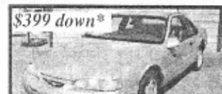
$399 down* T-Bird, auto, all power equip.