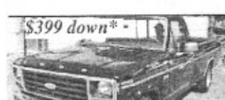
$399 down* F150, 4x2, auto, Runs Great, 6 cyl

Payments As Low As $59 a week* HURRY! These Deals Won't Last!!!