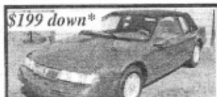
$199 down* Cougar, auto, All Pwr, Runs Great

MARTY'S AUTO SALES • 986-2222 • MARTY'S AUTO SALES • 986-2222 • MARTY'S AUTO SALES • 986-2222 • MARTY'S AUTO SALES • 986-2222 • MARTY'S AUTO SALES • 986-2222