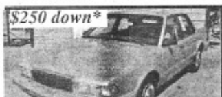
$250 down* Century, 6cyl, all power, Gas Saver

$250 DOWN* IS ALL YOU NEED THIS WEEK ONLY ANY CAR