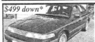
$499 down* Crown Vic, All Power Equip, Nice