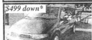
$499 down* Villager, Loaded, V6, Extra Clean