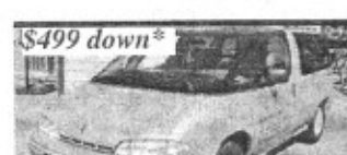
$499 down* Transport Van, 7 pass, Cold AC