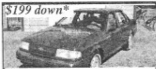
$199 down* Tempo, 4cyl, Great on Gas