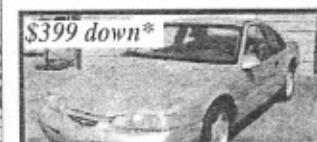
$399 down* T-Bird, auto, all power equip.