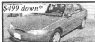
$499 down* Escort, auto, Great Gas Saver