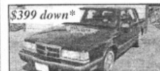
$399 down* Dynasty, Ex. Clean, Runs Great