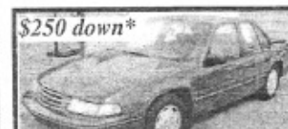
$250 down* Lumina, V6, auto, AC, Runs Great