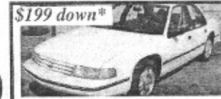
$199 down* Lumina, Runs Great, Factory Equip