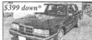
$399 down* Dynasty, Ex. Clean, Runs Great