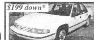
$199 down* Lumina, Runs Great, Factory Equip