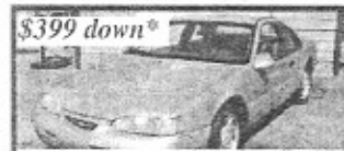
$399 down* T-Bird, auto, all power equip.