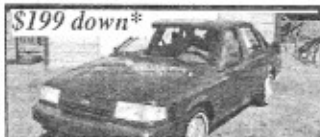
$199 down* Tempo, 4cyl, Great on Gas