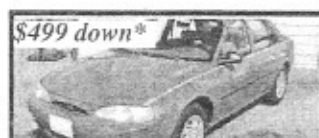
$499 down* Escort, auto, Great Gas Saver