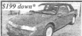
$199 down* Cougar, auto, All Pwr, Runs Great

MARTY'S AUTO SALES • 986-2222 • MARTY'S AUTO SALES • 986-2222 • MARTY'S AUTO SALES • 986-2222 • MARTY'S AUTO SALES • 986-2222 • MARTY'S AUTO SALES • 986-2222