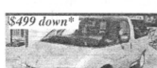
$499 down* Transport Van, 7 pass, Cold AC