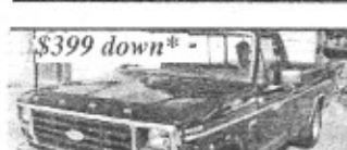
$399 down* F150, 4x2, auto, Runs Great, 6 cyl

Payments As Low As $59 a week* HURRY! These Deals Won't Last!!!