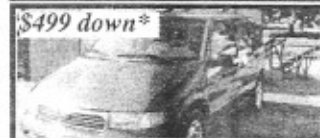
$499 down* Villager, Loaded, V6, Extra Clean