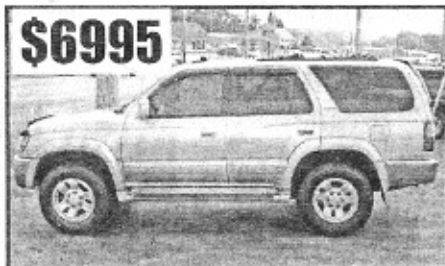
1997 Toyota 4Runner LIMITED 4X4, X-tra clean, Loaded