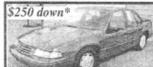
$250 down* Lumina, V6, auto, AC, Runs Great