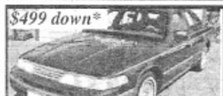
$499 down* Crown Vic, All Power Equip, Nice