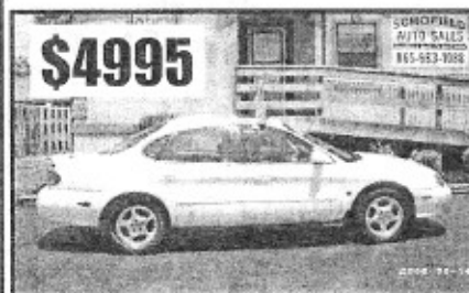
1999 Ford Taurus SE Top of the line Must see to appreciate