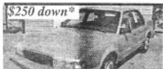
$250 down* Century, 6cyl, all power, Gas Saver

$250 DOWN* IS ALL YOU NEED THIS WEEK ONLY ANY CAR