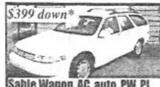
Sable Wagon, AC, auto, PW, PL