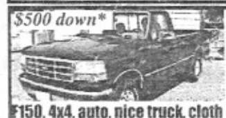
F150, 4x4, auto, nice truck, cloth