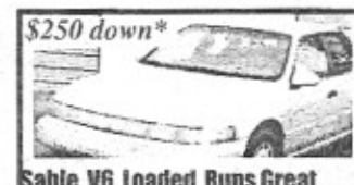
Sable, V6, Loaded, Runs Great