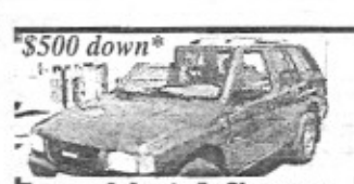
Trooper, 4x4, auto, Ex. Clean, pwr.