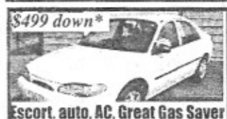
Escort, auto, AC, Great Gas Saver