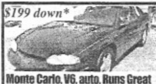
Monte Carlo, V6, auto, Runs Great