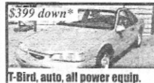
T-Bird, auto, all power equip.