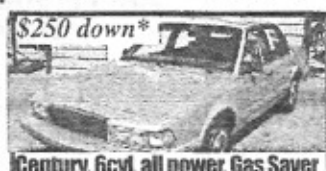
Century, 6cyl, all power, Gas Saver