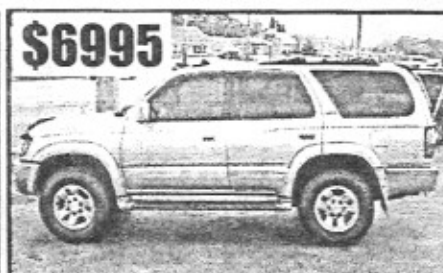
$6995 1997 Toyota 4Runner LIMITED 4X4, X-tra clean, Loaded