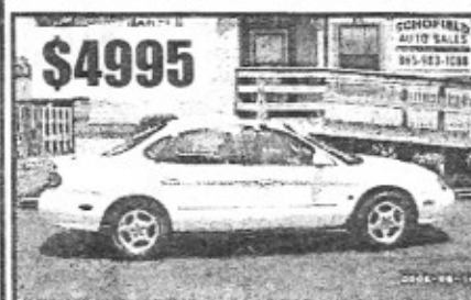
$4995 1999 Ford Taurus SE Top of the line Must see to appreciate