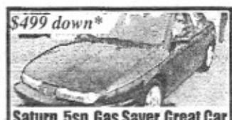
Saturn, 5sp, Gas Saver, Great Car