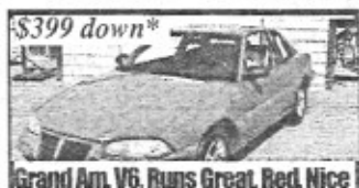
Grand Am, V6, Runs Great, Red, Nice