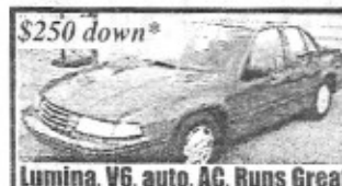
Lumina, V6, auto, AC, Runs Great