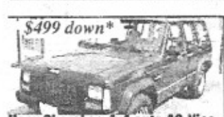
Jeep Cherokee, 4x4, auto, AC, Nice

Payments As Low As $59 a week* HURRY! These Deals Won't Last!!!