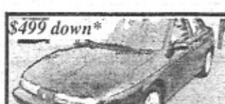
$499 down* Saturn, 5sp, Gas Saver, Great Car