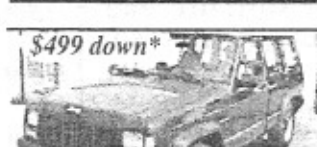
$499 down* Jeep Cherokee, 4x4, auto, AC, Nice