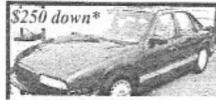
$250 down* Regal, V6, all power, auto