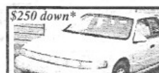
$250 down* Sable, V6, Loaded, Runs Great