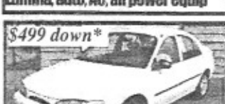
$499 down* Escort, auto, AC, Great Gas Saver

Payments As Low As $59 a week* HURRY! These Deals Won't Last!!!