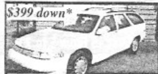
$399 down* Sable Wagon, AC, auto, PW, PL