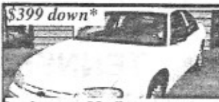
$399 down* Lumina, auto, AC, all power equip