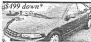
$499 down* Breeze, auto, AC, all power, 4cyl