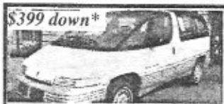
$399 down* Lumina Van, all pwr, 7 passenger

MARTY'S AUTO SALES • 986-2222 • MARTY'S AUTO SALES • 986-2222 • MARTY'S AUTO SALES • 986-2222 • MARTY'S AUTO SALES • 986-2222 • MARTY'S AUTO SALES • 986-2222