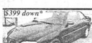
$399 down* Grand Am, 5sp, Gas Saver, Nice Car