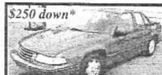
$250 down* Lumina, V6, auto, AC, Runs Great