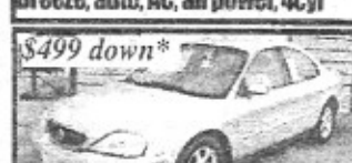
$499 down* Sable, ex. clean, V6, loaded