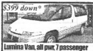
$399 down* Lumina Van, all pwr, 7 passenger

MARTY'S AUTO SALES • 986-2222 • MARTY'S AUTO SALES • 986-2222 • MARTY'S AUTO SALES • 986-2222 • MARTY'S AUTO SALES • 986-2222 • MARTY'S AUTO SALES • 986-2222