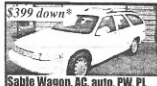
$399 down* Sable Wagon, AC, auto, PW, PL