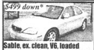
$499 down* Sable, ex. clean, V6, loaded