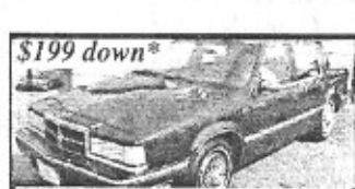
$199 down* Dynasty, auto, all power, AC