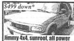
$499 down* Jimmy 4x4, sunroof, all power