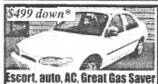
$499 down* Escort, auto, AC, Great Gas Saver