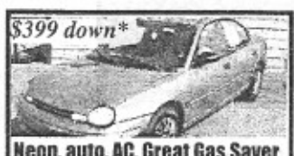
$399 down* Neon, auto, AC, Great Gas Saver