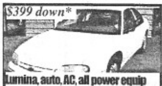
$399 down* Lumina, auto, AC, all power equip