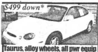
$499 down* Taurus, alloy wheels, all pwr equip