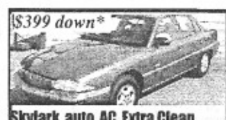
$399 down* Skylark, auto, AC, Extra Clean