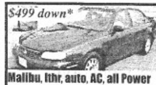
$499 down* Malibu, lthr, auto, AC, all Power