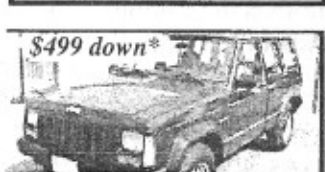
$499 down* Deep Cherokee, 4x4, auto, AC, Nice

Payments As Low As $59 a week* HURRY! These Deals Won't Last!!!