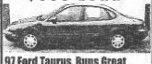
97 Ford Taurus, Runs Great