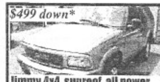
$499 down* Jimmy 4x4, sunroof, all power