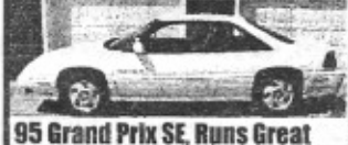
95 Grand Prix SE, Runs Great