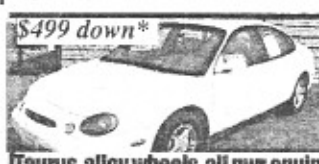
$499 down* Taurus, alloy wheels, all pwr equip