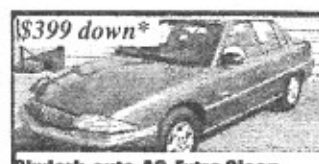
$399 down* Skylark, auto, AC, Extra Clean