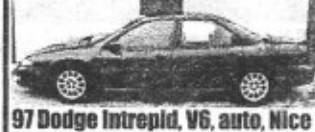
97 Dodge Intrepid, V6, auto, Nice