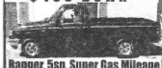
Ranger, 5sp, Super Gas Mileage