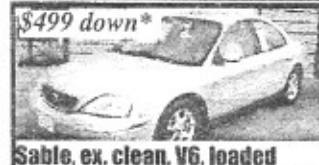
$499 down* Sable, ex. clean, V6, loaded