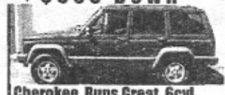
Cherokee, Runs Great, 6cyl