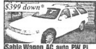
$399 down* Sable Wagon, AC, auto, PW, PL