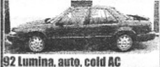
92 Lumina, auto, cold AC