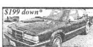
$199 down* Dynasty, auto, all power, AC