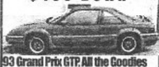
93 Grand Prix GTP, All the Goodies