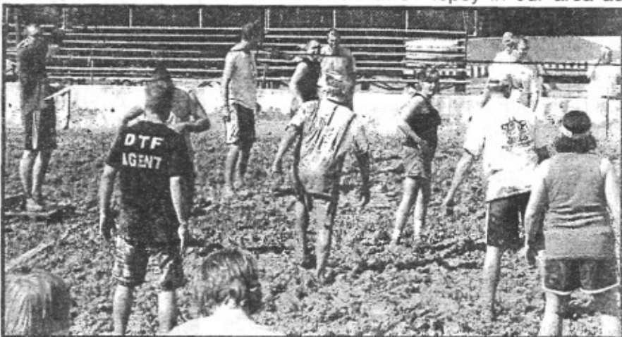
Down & Dirty have a blast playing volleyball for the East Tennessee Epilepsy Foundation

event and the proceeds benefit those who suffer from epilepsy in our area as