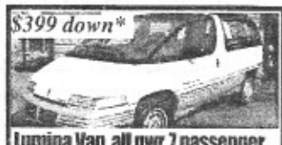
$399 down* Lumina Van, all pwr, 7 passenger

MARTY'S AUTO SALES • 986-2222 • MARTY'S AUTO SALES • 986-2222 • MARTY'S AUTO SALES • 986-2222 • MARTY'S AUTO SALES • 986-2222 • MARTY'S AUTO SALES • 986-2222