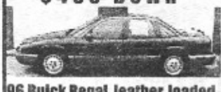
96 Buick Regal, leather, loaded