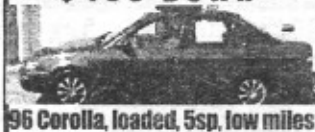
96 Corolla, loaded, 5sp, low miles