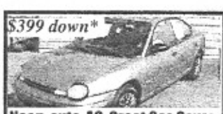
$399 down* Neon, auto, AC, Great Gas Saver