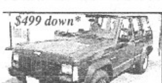
$499 down* Jeep Cherokee, 4x4, auto, AC, Nice

Payments As Low As $59 a week* HURRY! These Deals Won't Last!!!