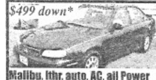
$499 down* Malibu, lthr, auto, AC, all Power