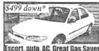
$499 down* Escort, auto, AC, Great Gas Saver