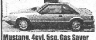
Mustang, 4cyl, 5sp, Gas Saver