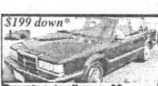
$199 down* Dynasty, auto, all power, AC