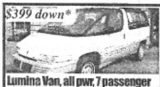
$399 down* Lumina Van, all pwr, 7 passenger

MARTY'S AUTO SALES • 986-2222 • MARTY'S AUTO SALES • 986-2222 • MARTY'S AUTO SALES • 986-2222 • MARTY'S AUTO SALES • 986-2222 • MARTY'S AUTO SALES • 986-2222