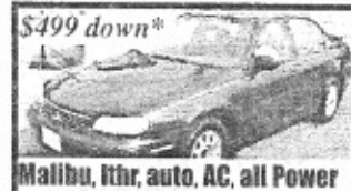
$499 down* Malibu, lthr, auto, AC, all Power