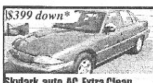
$399 down* Skylark, auto, AC, Extra Clean