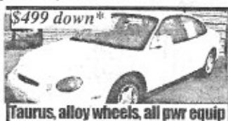
$499 down* Taurus, alloy wheels, all pwr equip