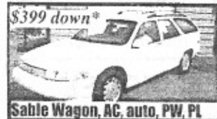
$399 down* Sable Wagon, AC, auto, PW, PL