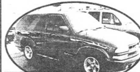
2004 Chevy Blazer Extreme, RARE FIND, Loaded w/roof