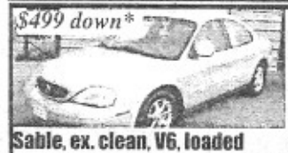
$499 down* Sable, ex. clean, V6, loaded