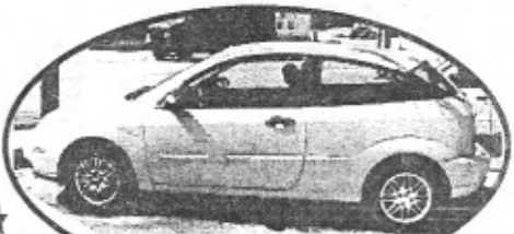
2006 Ford Focus, GREAT GAS MILEAGE, Get it before it's gone!