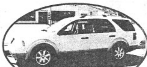
2005 Ford Freestyle, Great Family Vehicle, Nice Ride

*W.A.C. (with approved credit). All sales subject to credit approval