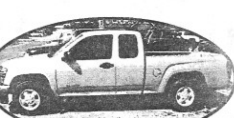
2005 Chevy Colorado, X-Cab, Auto, Low Miles, Good MPG