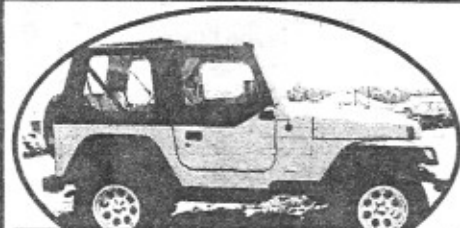
1997 Jeep Wrangler, 4x4, AC, 5speed, 4 cyl, 65k miles

When you've tried the rest, come to the best!