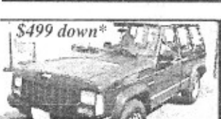
$499 down* Jeep Cherokee, 4x4, auto, AC, Nice

Payments As Low As $59 a week* HURRY! These Deals Won't Last!!!