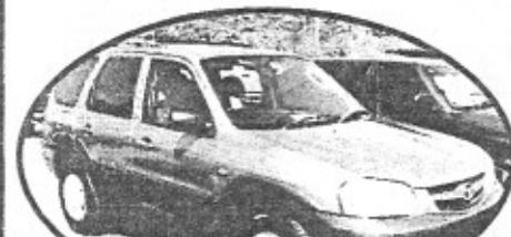
2003 Mazda Tribute, Loaded, Super Nice