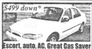
$499 down* Escort, auto, AC, Great Gas Saver