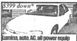
$399 down* Lumina, auto, AC, all power equip