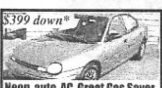
$399 down* Neon, auto, AC, Great Gas Saver