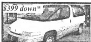
$399 down* Lumina Van, all pwr, 7 passenger

MARTY'S AUTO SALES • 986-2222 • MARTY'S AUTO SALES • 986-2222 • MARTY'S AUTO SALES • 986-2222 • MARTY'S AUTO SALES • 986-2222 • MARTY'S AUTO SALES • 986-2222