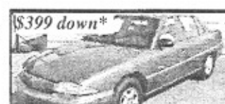
$399 down* Skylark, auto, AC, Extra Clean