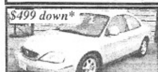
$499 down* Sable, ex. clean, V6, loaded