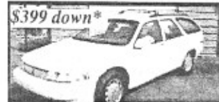
$399 down* Sable Wagon, AC, auto, PW, PL