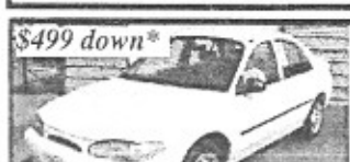
$499 down* Escort, auto, AC, Great Gas Saver