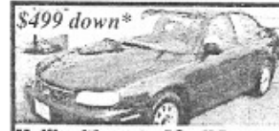
$499 down* Malibu, lthr, auto, AC, all Power