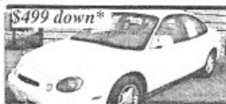
$499 down* Taurus, alloy wheels, all pwr equip