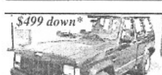
$499 down* Jeep Cherokee, 4x4, auto, AC, Nice

Payments As Low As $59 a week* HURRY! These Deals Won't Last!!!