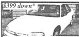
$399 down* Lumina, auto, AC, all power equip