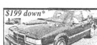
$199 down* Dynasty, auto, all power, AC