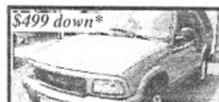
$499 down* Jimmy 4x4, sunroof, all power