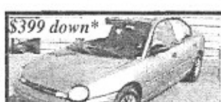
$399 down* Neon, auto, AC, Great Gas Saver