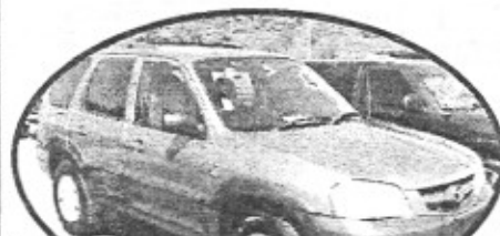
2003 Mazda Tribute, Loaded, Super Nice