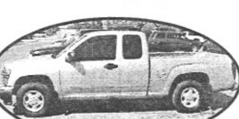
2005 Chevy Colorado, X-Cab, Auto, Low Miles, Good MPG