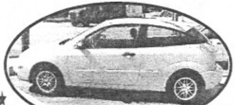
2006 Ford Focus, GREAT GAS MILEAGE, Get it before it's gone!