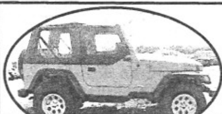
1997 Jeep Wrangler, 4x4, AC, 5speed, 4 cyl, 65k miles

All calls are kept strictly confidential.