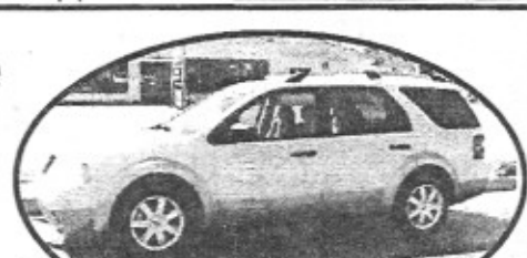
2005 Ford Freestyle, Great Family Vehicle, Nice Ride

*W.A.C. (with approved credit). All sales subject to credit approval