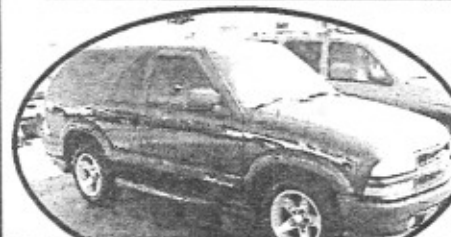
2004 Chevy Blazer Extreme, RARE FIND, Loaded w/roof