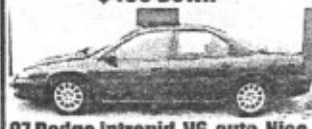
97 Dodge Intrepid, V6, auto, Nice