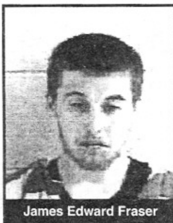
James Edward Fraser