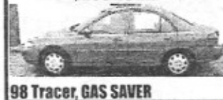
98 Tracer, GAS SAVER