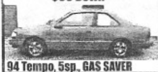
94 Tempo, 5sp., GAS SAVER