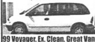
99 Voyager, Ex. Clean, Great Van