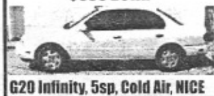
G20 Infiniti, 5sp, Cold Air, NICE