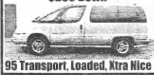
95 Transport, Loaded, Xtra Nice