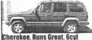
Cherokee, Runs Great, 6cyl