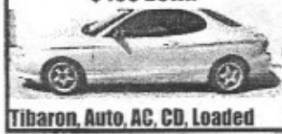
Tibaron, Auto, AC, CD, Loaded