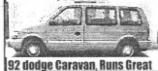
92 Dodge Caravan, Runs Great