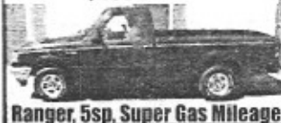
Ranger, 5sp, Super Gas Mileage