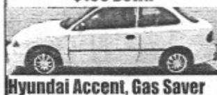
Hyundai Accent, Gas Saver