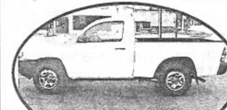
2005 Toyota Tacoma, auto, nice truck, GREAT MILES