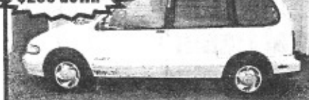
93 Nissan Quest, loaded, all power