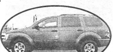
2004 Dodge Durango, Loaded, 3rd row seating