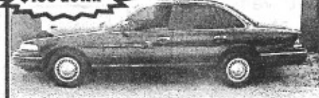
97 Crown Vic, Police Package