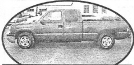
2003 Chevy Silverado, Extra Cab, loaded, SHARP TRUCK!!