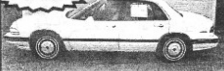
94 Buick Lesabre, V6, auto all power