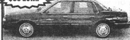
94 Olds Cierra, Very Nice