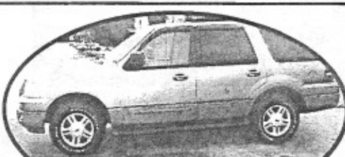
2003 Ford Expedition, PL, PW, Tilt, Cruise, 3rd Row Seating