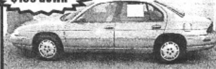
96 Lumina, Runs Great, Clean