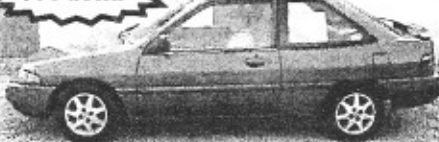
95 Escort, sporty, Runs Good.