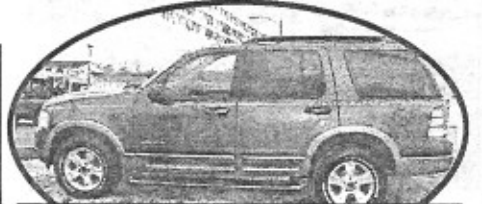
2004 Ford Explorer, Eddie Bauer Edition, 3rd row seating