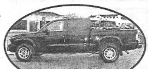
2003 Dodge Dakota Quad Cab, auto, V6, LOADED