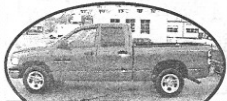
2005 Dodge Ram Quad Cab, auto, LOW MILES