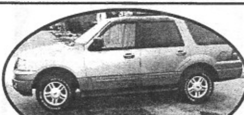
2003 Ford Expedition, PL, PW, Tilt, Cruise, 3rd Row Seating