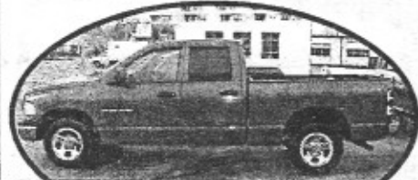
2005 Dodge Ram Quad Cab, auto, LOW MILES