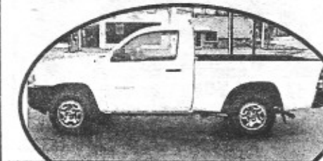
2005 Toyota Tacoma, auto, nice truck, GREAT MILES