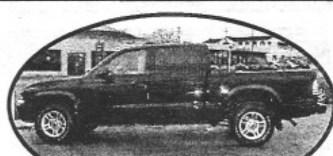
2003 Dodge Dakota Quad Cab, auto, V6, LOADED