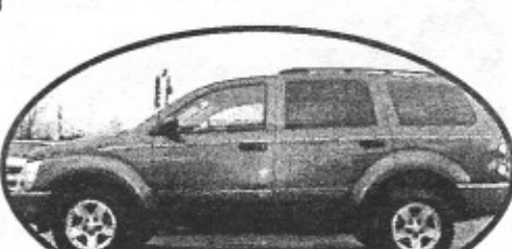
2004 Dodge Durango, Loaded, 3rd row seating