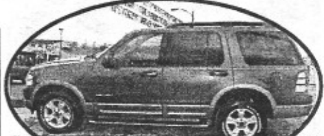
2004 Ford Explorer, Eddie Bauer Edition, 3rd row seating