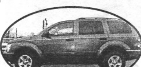
2004 Dodge Durango, Loaded, 3rd row seating