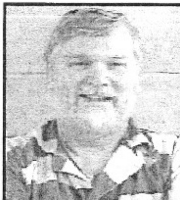
Roy Daniel Acuff