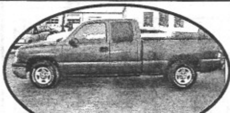
2003 Chevy Silverado, Extra Cab, loaded, SHARP TRUCK!!