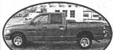
2005 Dodge Ram Quad Cab, auto, LOW MILES