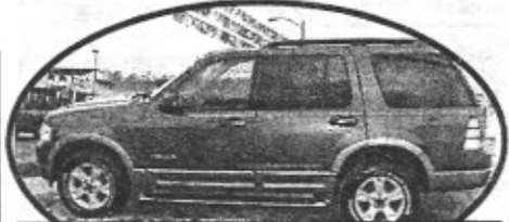
2004 Ford Explorer, Eddie Bauer Edition, 3rd row seating