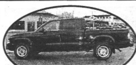
2003 Dodge Dakota Quad Cab, auto, V6, LOADED