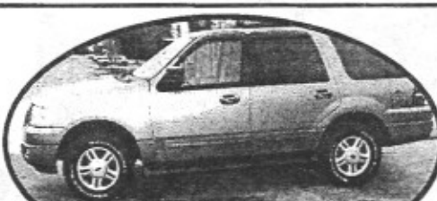
2003 Ford Expedition, PL, PW, Tilt, Cruise, 3rd Row Seating