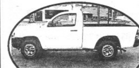
2005 Toyota Tacoma, auto, nice truck, GREAT MILES