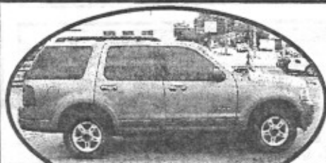
2002 Ford Explorer XLT, tan, 4x4, 3rd row seat, LOADED