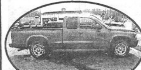
2004 Dakota Club Cab, low miles, auto, V6, LOW PAYMENTS