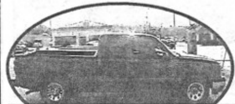
2005 Chevy Silverado, ex. cab, V8, auto, LOW MILES