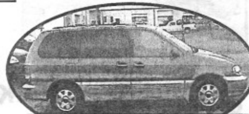
2003 Kia Sedona, loaded, dual sliding doors, Capt. Chairs, Low Miles