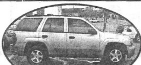
2003 Chevy Trailblazer, tan, LOADED, Great Payments