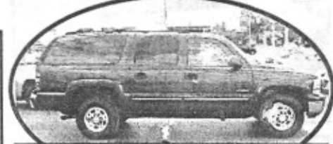
2000 Chevy Suburban, blue, 4x4, 3rd row seat, 3/4 ton, LOW MILES