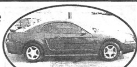
2003 Ford Mustang, auto, AC, loaded, LOW PAYMENTS