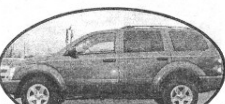
2004 Dodge Durango, Loaded, 3rd row seating