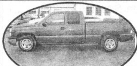
2003 Chevy Silverado, Extra Cab, loaded, SHARP TRUCK!!