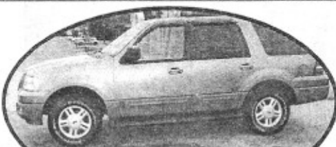
2003 Ford Expedition, PL, PW, Tilt, Cruise, 3rd Row Seating