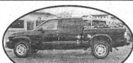
2003 Dodge Dakota Quad Cab, auto, V6, LOADED