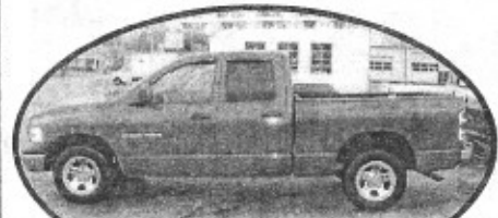
2005 Dodge Ram Quad Cab, auto, LOW MILES