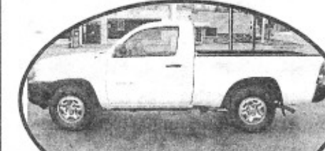
2005 Toyota Tacoma, auto, nice truck, GREAT MILES