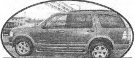
2004 Ford Explorer, Eddie Bauer Edition, 3rd row seating