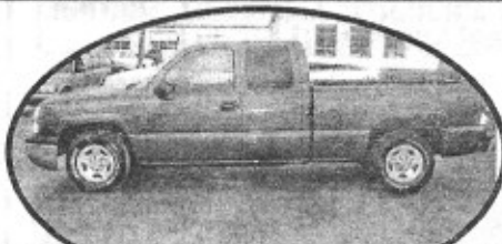
2003 Chevy Silverado, Extra Cab, loaded, SHARP TRUCK!!