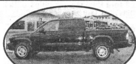
2003 Dodge Dakota Quad Cab, auto, V6, LOADED