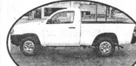
2005 Toyota Tacoma, auto, nice truck, GREAT MILES