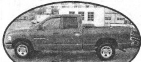
2005 Dodge Ram Quad Cab, auto, LOW MILES