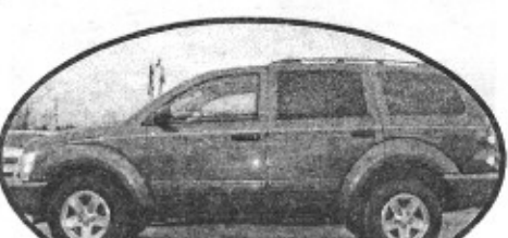
2004 Dodge Durango, Loaded, 3rd row seating