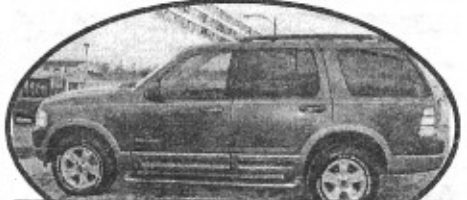
2004 Ford Explorer, Eddie Bauer Edition, 3rd row seating