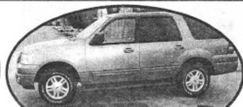
2003 Ford Expedition, PL, PW, Tilt, Cruise, 3rd Row Seating