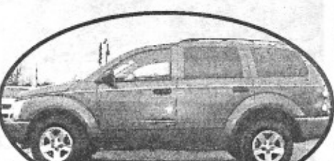
2004 Dodge Durango, Loaded, 3rd row seating