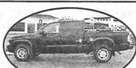
2003 Dodge Dakota Quad Cab, auto, V6, LOADED