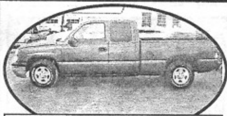
2003 Chevy Silverado, Extra Cab, loaded, SHARP TRUCK!!