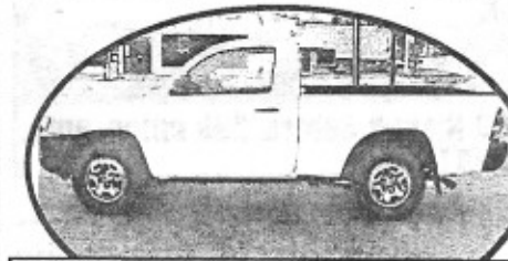
2005 Toyota Tacoma, auto, nice truck, GREAT MILES