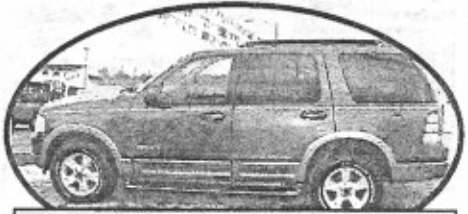
2004 Ford Explorer, Eddie Bauer Edition, 3rd row seating