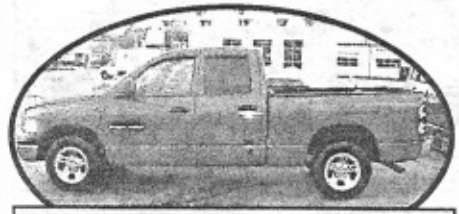
2005 Dodge Ram Quad Cab, auto, LOW MILES