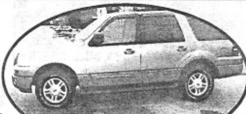
2003 Ford Expedition, PL, PW, Tilt, Cruise, 3rd Row Seating