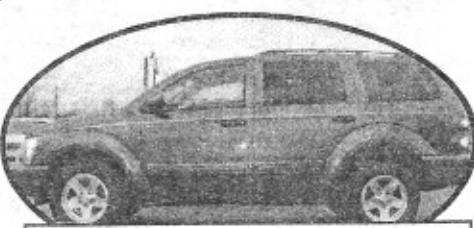
2004 Dodge Durango, Loaded, 3rd row seating