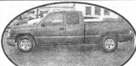
2003 Chevy Silverado, Extra Cab, loaded, SHARP TRUCK!!