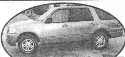
2003 Ford Expedition, PL, PW, Tilt, Cruise, 3rd Row Seating