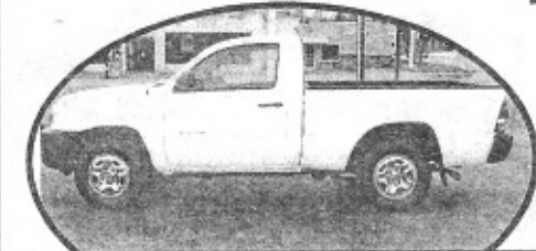
2005 Toyota Tacoma, auto, nice truck, GREAT MILES