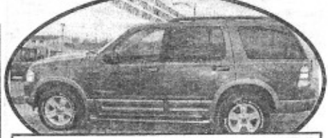
2004 Ford Explorer, Eddie Bauer Edition, 3rd row seating