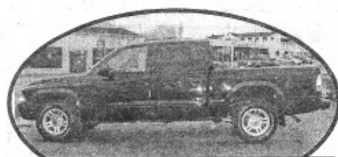
2003 Dodge Dakota Quad Cab, auto, V6, LOADED