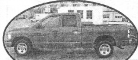
2005 Dodge Ram Quad Cab, auto, LOW MILES