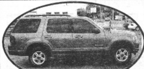
2002 Ford Explorer XLT, tan, 4x4, 3rd row seat, LOADED