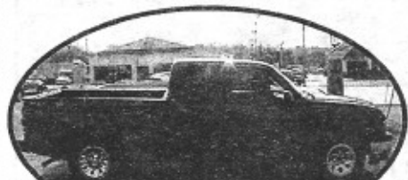
2005 Chevy Silverado, ex. cab, V8, auto, LOW MILES