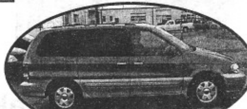
2003 Kia Sedona, loaded, dual sliding doors, Capt. Chairs, Low Miles