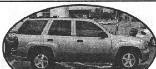
2003 Chevy Trailblazer, tan, LOADED, Great Payments