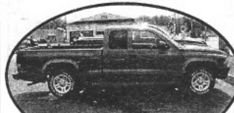
2004 Dakota Club Cab, low miles, auto, V6, LOW PAYMENTS