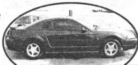
2003 Ford Mustang, auto, AC, loaded, LOW PAYMENTS