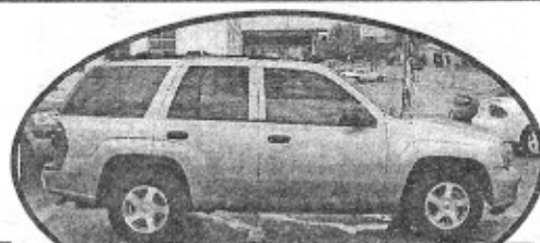
2003 Chevy Trailblazer, tan, LOADED, Great Payments