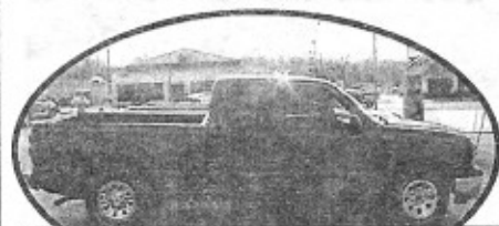
2005 Chevy Silverado, ex. cab, V8, auto, LOW MILES