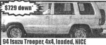
94 Isuzu Trooper, 4x4, loaded, NICE