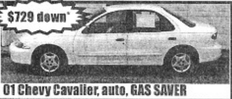
01 Chevy Cavalier, auto, GAS SAVER