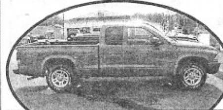
2004 Dakota Club Cab, low miles, auto, V6, LOW PAYMENTS