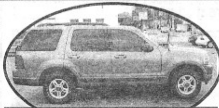
2002 Ford Explorer XLT, tan, 4x4, 3rd row seat, LOADED