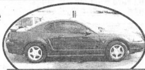
2003 Ford Mustang, auto, AC, loaded, LOW PAYMENTS