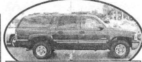
2000 Chevy Suburban, blue, 4x4, 3rd row seat, 3/4 ton, LOW MILES