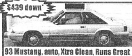
93 Mustang, auto, Xtra Clean, Runs Great