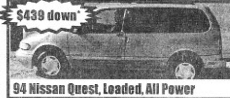
94 Nissan Quest, Loaded, All Power