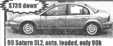
99 Saturn SL2, auto, loaded, only 90k

All Cash Offers Welcome • New Hours M-F 9am-7pm Sat 9am-3pm • All Cash Offers Welcome