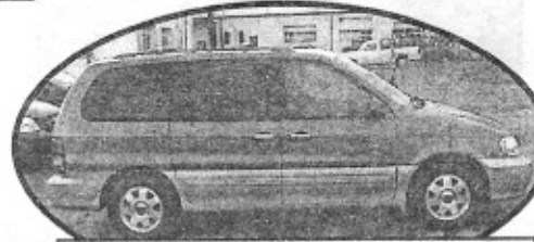
2003 Kia Sedona, loaded, dual sliding doors, Capt. Chairs, Low Miles