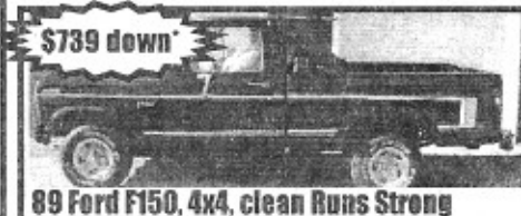
89 Ford F150, 4x4, clean Runs Strong