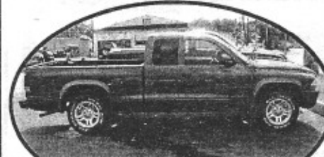
2004 Dakota Club Cab, low miles, auto, V6, LOW PAYMENTS