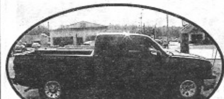
2005 Chevy Silverado, ex. cab, V8, auto, LOW MILES