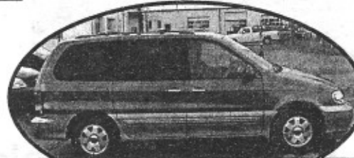
2003 Kia Sedona, loaded, dual sliding doors, Capt. Chairs, Low Miles