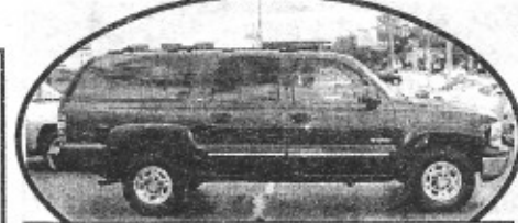
2000 Chevy Suburban, blue, 4x4, 3rd row seat, 3/4 ton, LOW MILES