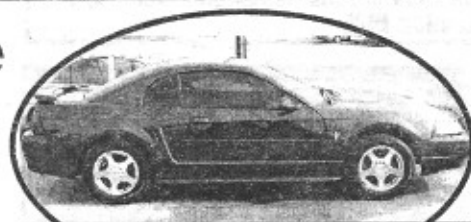
2003 Ford Mustang, auto, AC, loaded, LOW PAYMENTS