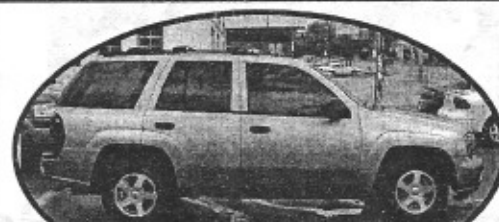
2003 Chevy Trailblazer, tan, LOADED, Great Payments