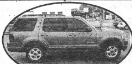
2002 Ford Explorer XLT, tan, 4x4, 3rd row seat, LOADED