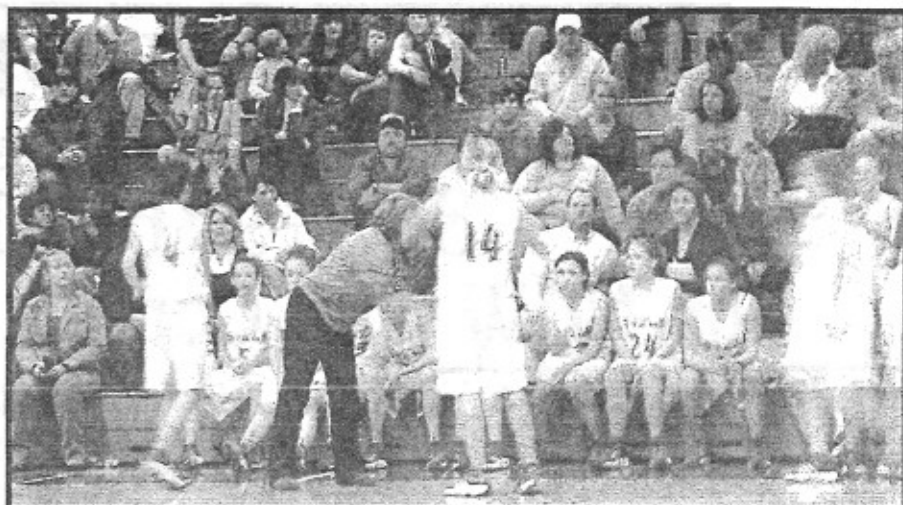
(Above) The North Middle School Lady Stars talk things over during a timeout thursday night. The boys and girls teams swept the Cherokees with scores of 28-36 in the ladies game and a score of 38-43 in the boys matchup.