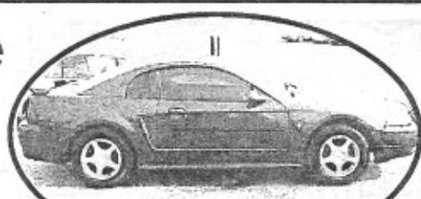
2003 Ford Mustang, auto, AC, loaded, LOW PAYMENTS