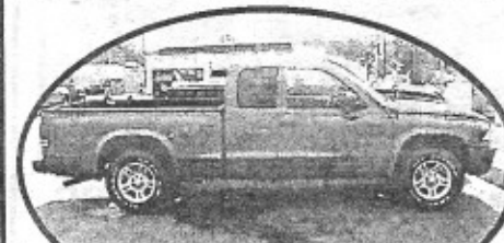
2004 Dakota Club Cab, low miles, auto, V6, LOW PAYMENTS