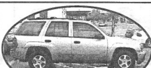
2003 Chevy Trailblazer, tan, LOADED, Great Payments