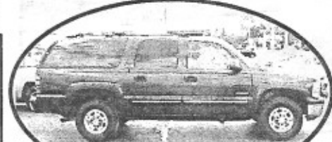
2000 Chevy Suburban, blue, 4x4, 3rd row seat, 3/4 ton, LOW MILES