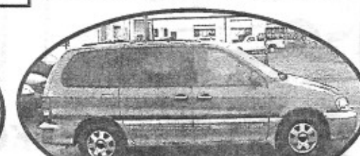
2003 Kia Sedona, loaded, dual sliding doors, Capt. Chairs, Low Miles