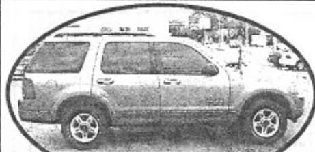
2002 Ford Explorer XLT, tan, 4x4, 3rd row seat, LOADED