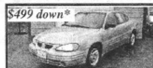
99 Grand Am Gas Saver