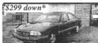
92 Olds 88 Runs Great