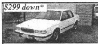
91 Century Nice Car