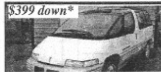
95 Transport, Low Mileage