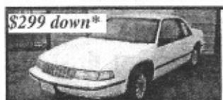
90 Lumina V6, auto