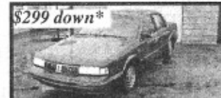
96 Cierra. Runs Great