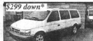
95 Caravan, SE NICE