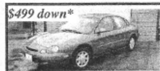
96 Taurus. Runs Great