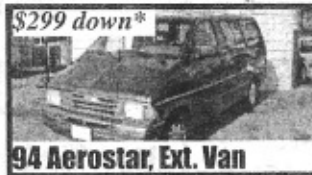
94 Aerostar, Ext. Van