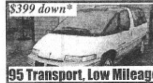
95 Transport, Low Mileage