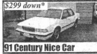
91 Century Nice Car