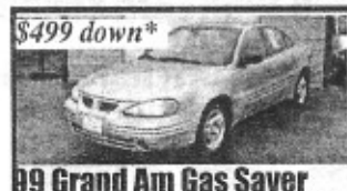
99 Grand Am Gas Saver