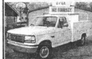
97 Ford F250 Utility Truck only 77k miles. Super Buy Great Work Truck