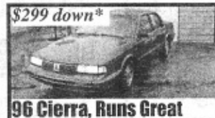
96 Cierra, Runs Great